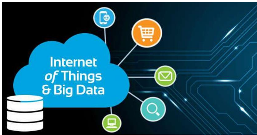
Fig 1. Overview of Big data and IoT