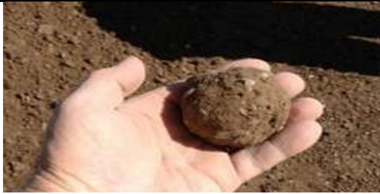
Fig.4.2. Field demonstration of surface gravel with an outstanding binding characteristic