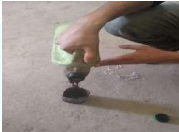
Fig.3.1. Bitumen emulsion sample4

Bituminous materials or asphalts are extensively used for roadway construction, primarily because of their excellent binding characteristics and water proofing properties and relatively low cost. Bituminous materials consists of bitumen which is a black or dark colored solid or viscous cementitious substances consists chiefly high molecular weight hydrocarbons derived from distillation of petroleum or natural asphalt, has adhesive properties, and is soluble in carbon disulphide. Tars are residues from the destructive distillation of organic substances such as coal, wood, or petroleum and are temperature sensitive than bitumen. Bitumen will be dissolved in petroleum oils where unlike tar.