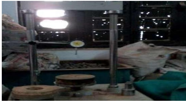
Figure: C.B.R. TEST

communicated as rate for a given entrance of the plunger. This worth is communicated in rate. Standard heap of diverse infiltration is talked about some time.