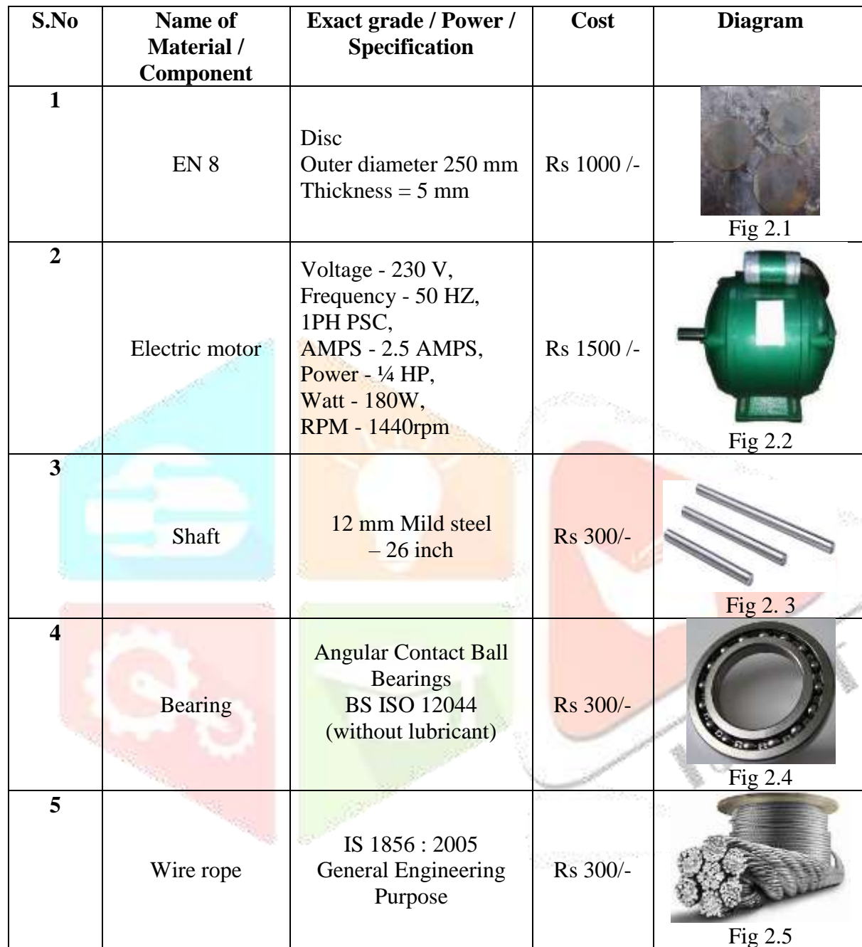
Table 1 Material used

This research focus on the material used to develop basic wear machine using materials are enlisted below table 1