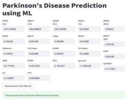
Fig 4. Parkinson's disease Prediction

gathering patient data containing information such as demographics, medical history, lifestyle factors, and clinical tests related to diabetes. Once collected, the dataset undergoes preprocessing to handle missing values, remove duplicates, and normalize or scale features. Feature selection or engineering identifies the most informative factors indicative of diabetes onset or progression, drawing upon both domain knowledge and data-driven techniques. ML algorithms like logistic regression, decision trees, random forests, or neural networks are then selected for model training. The dataset is split into training and testing sets, and models are evaluated using metrics such as accuracy, precision, recall, and F1-score. Understanding the model's predictions aids in interpreting risk factors and guiding preventive measures or treatment decisions. Ultimately, the deployed model undergoes continuous monitoring and updates to maintain its effectiveness in clinical or research settings. Collaboration among data scientists, healthcare professionals, and domain experts is essential throughout this process to ensure the development of robust and clinically relevant prediction models for diabetes