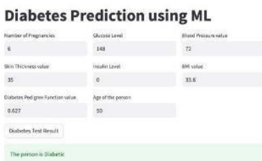
Fig 5. Diabetes prediction

professionals, experimenters, and individualities to make informed opinions regarding complaint threat assessment and operation. Accurate complaint vaticination using machine literacy models has the