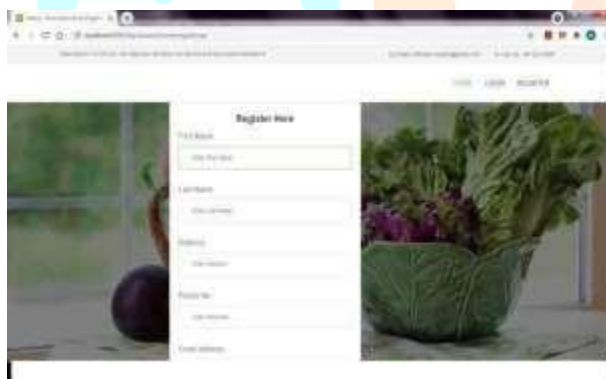
v.iii. Registration of User