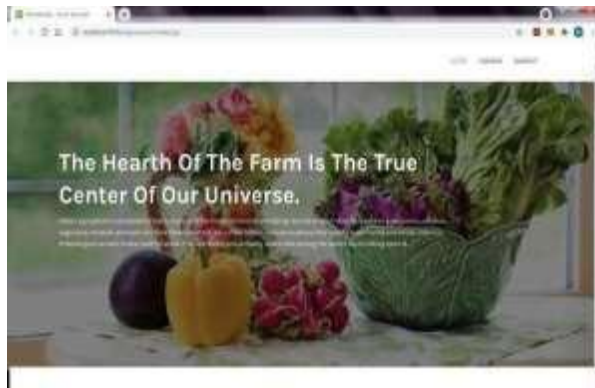
v.i. Home Page of website