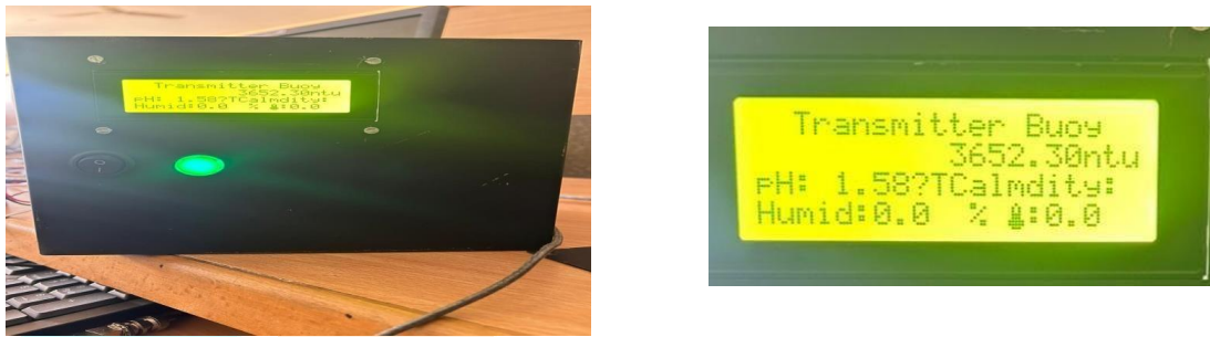
Fig 2: Transmitter

The transmitter monitors several characteristics in the water supply to determine its quality and health. These factors include pH and turbidity. pH value is an important measure of water acidity or alkalinity, impacting aquatic life and overall ecosystem balance. By detecting pH, the transmitter can identify possible changes that may signal pollution, contamination, or natural variations. Turbidity, on the other hand, is defined as the cloudiness or haziness of water caused by suspended particles, sediments, or organic matter. High turbidity can reduce light penetration, harming aquatic ecosystems and signaling sediment flow or other problems.