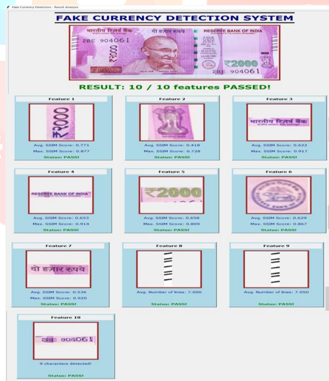
Fig. 4: GUI showing final result (real one)

The machine learning-based approach proposed for counterfeit currency detection demonstrated remarkable efficacy, boasting an impressive overall accuracy of 98.5% on the test dataset. This accuracy, coupled with precision and recall scores exceeding 0.95 for both genuine and counterfeit notes, underscores the model's capability in accurate identification while minimizing false positives. Nevertheless, the study acknowledges certain limitations, notably the model's sensitivity to image quality and orientation variations, particularly in low-resolution or poorly illuminated settings. Future research efforts could focus on fortifying the model's resilience to such challenges through innovative preprocessing techniques or additional feature extraction methods.