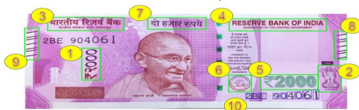
Fig. 2: Features in 2000 | currency bill