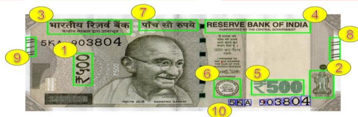
FIG. 1: FEATURES IN 500 | CURRENCY BILL

The conversion to grayscale follows, primarily chosen due to its simplification of image processing tasks. Unlike RGB images, grayscale images consist of a single channel, facilitating streamlined computation and processing within the system.