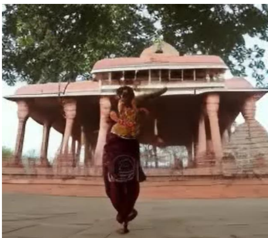
Fig 6.1 Generated Video

Our project serves as a bridge between tradition and innovation, forging connections between ancient cultural practices and contemporary technological advancements. By marrying the timeless elegance of Bharatanatyam with the cutting-edge potential of Generative AI, we create a symbiotic relationship that enriches both the cultural heritage and technological landscape of our society. Through collaborative partnerships with cultural institutions, educational organizations, and technology companies, we foster a holistic approach to cultural preservation and innovation, wherein tradition and innovation complement and reinforce each other. Our analysis of the synergies between tradition and innovation reveals a fertile ground for creative exploration and interdisciplinary collaboration, paving the way for a future where ancient traditions thrive in harmony with modern technological advancements.