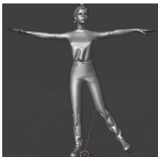
Fig 6.2 Generated Avatar Model