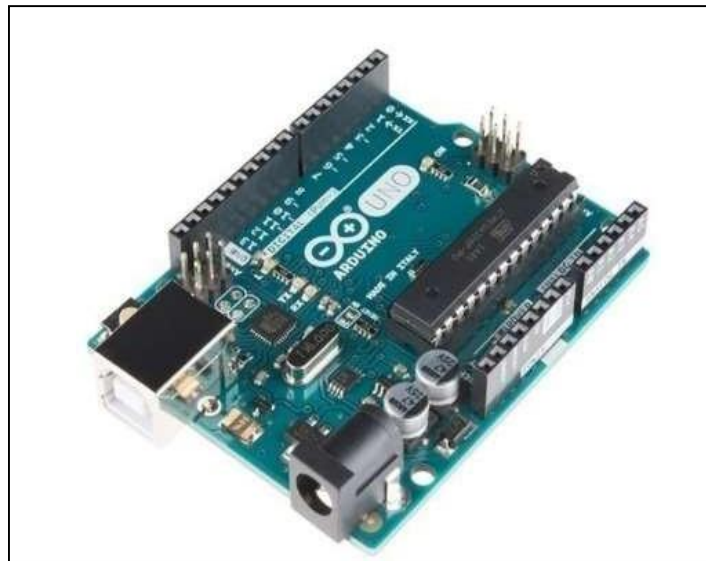
Fig. 4: ARDUINO UNO microcontroller