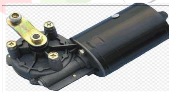
Fig. 3: 12 volt, 100 rpm geared DC motor

A DC motor is any of a category of electrical machines that converts electricity wattage into mechanical power. The foremost common varieties have confidence the forces made by magnetic fields.