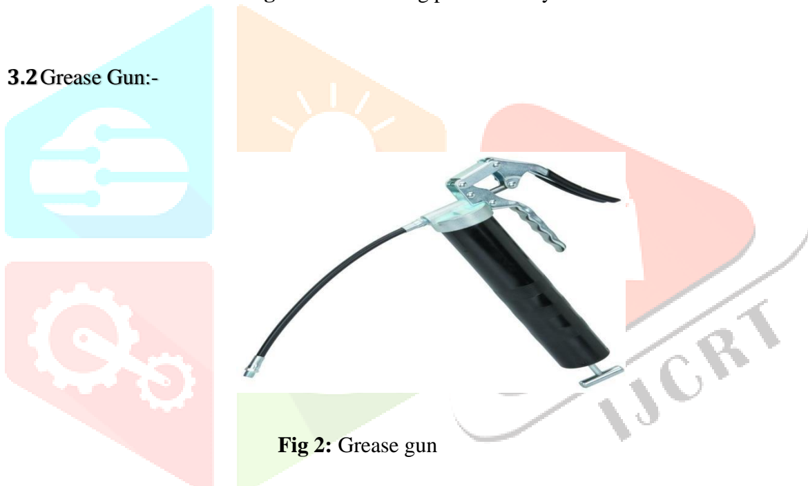
Fig 2: Grease gun

A grease gun is a device which is used for lubrication. Grease gun is applied for the purpose of pumping a lubricant to some particular point. The most common styles of grease guns include the lever, pistol grip, hand grip etc. The lever style is the most economic and mostly used of the grease guns.