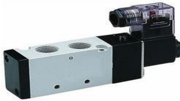
Fig 3: 3/2 solenoid control valve