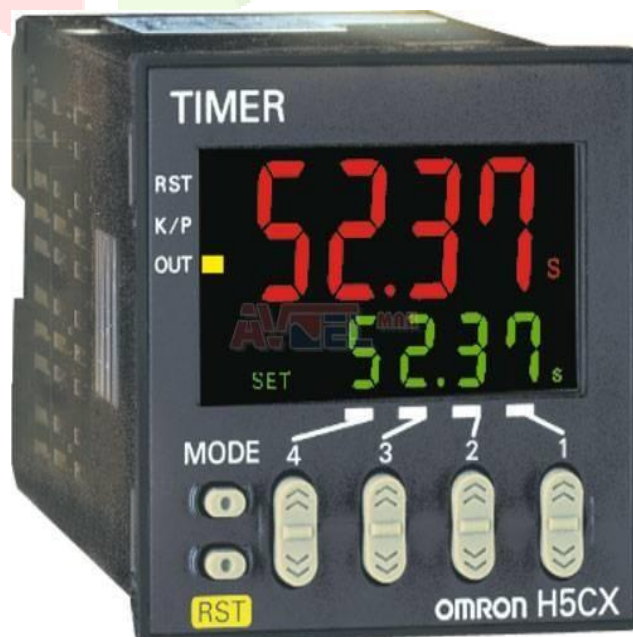
Fig 5: Digital timer

The digital timers are basically used in industry to control the operation with specified time interval of repetitive nature. It is basically a time clock with an arrangement for on or off operation at predetermine time interval.