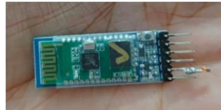
Fig: HC05 Bluetooth module

Wireless communication is swiftly replacing the wired connection when it comes to electronics and communication. Designed to replace cable connections HC-05 uses serial communication to communicate with the electronics. Usually, it is used to connect small devices like mobile phones using a short-range wireless connection to exchange files. It uses the 2.45GHz frequency band. The transfer rate of the data can vary up to 1Mbps and is in range of 10 meters. The HC-05 module can be operated within 4-6V of power supply. It supports baud rate of 9600, 19200, 38400, 57600, etc. Most importantly it can be operated in Master-Slave mode which means it will neither send or receive data from external sources.