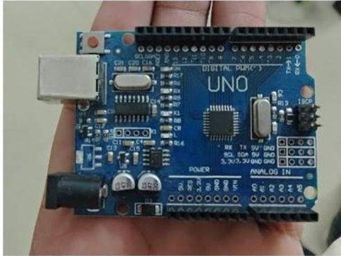
Fig: UNO R3 SMD BOARD ATMEGA328P

contains everything needed to support the microcontroller; simply connect it to a computer with a USB cable or power it with a AC-to-DC adapter or battery to get started. The "SMD" stands for surface-mount device, and the microcontroller (ATmega328p) is soldered directly to the board.