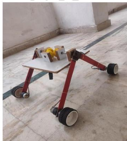
Fig. Project Final Image Side View

motion, which is absorbed by the gears. Since the bevel gears are connected to each other and to the frames via bolts, the rotational energy is distributed across the system, reducing the impact felt by any single component. This helps to smooth out the ride and protect the vehicle chassis from damage. Overall, the bevel gear mechanism effectively absorbs shocks by converting them into rotational energy. The differential which consists of a gear wheel with three drive shafts and the characteristic that the speed of rotation of one shaft is equal to the average speed of the others or a fixed multiple of this diameter is combined with an oscillating system and forms a springless suspension system the oscillation is repeated the frame of the system is mostly made of mild steel the frame that carries the tires oscillates freely and is connected to the differential by a motor that is attached to the gear of the differential mechanism making it the drive gear each bevel gear on either side of the drive gear connects it to two gears on each side of the driven gear. Each wheel has its own motor that powers it. Even on rough terrain, the oscillation function ensures that the vehicle continues to move forward, while the engine ensures that the wheels and gears keep turning.