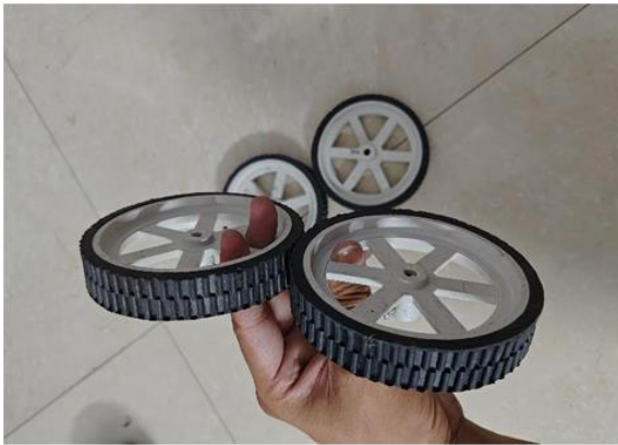
Fig: Rubber Visa Wheels