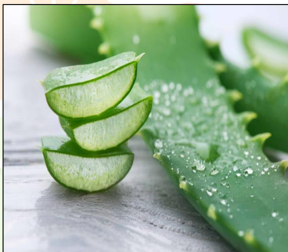
Fig 6. Aloe vera

Aloe vera has been studied for its potential antimalarial activity, although research is limited. Some studies suggest that Aloe vera extracts may: