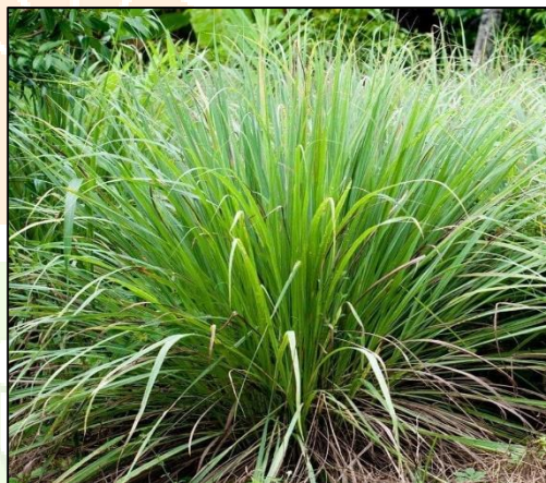
Fig. 4. Lemon grass

Lemongrass essential oil (LEO) has shown potential bioactive properties, but its antimalarial activity is not well-documented. However, LEO's antimicrobial and antioxidant properties could contribute to its potential effectiveness against various diseases. Key Components of Lemongrass Essential Oil: