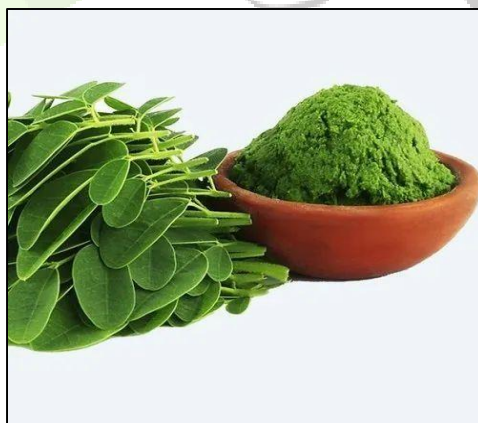
Fig 6. Moringa Oleifera

Moringa oleifera has shown potential antimalarial activity, with various studies confirming its efficacy against malaria-causing parasites. Here's a breakdown of its antimalarial properties.