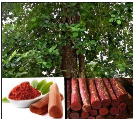
Fig. 5. Sandalwood

Sandalwood's antimalarial activity isn't extensively studied, but essential oils, including sandalwood, have shown potential in treating malaria. A study on 60 essential oils identified 15 with inhibitory activity against Plasmodium early mosquito stages. While sandalwood wasn't specifically highlighted, compounds like eugenol, eucalyptol, and limonene were identified as potential transmission-blocking agents.