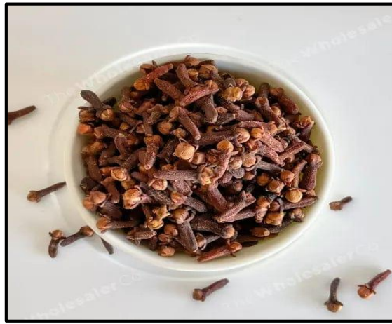
Fig 3. Clove