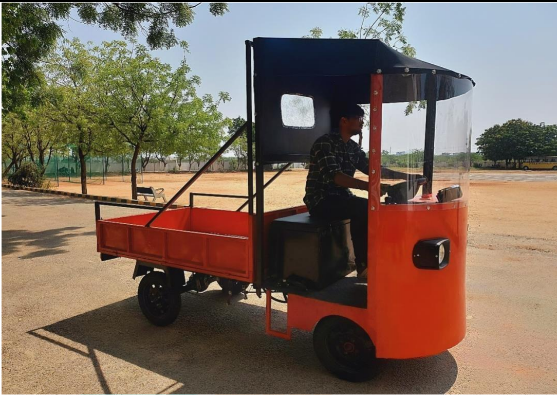
Fig 4.1 Final Image of Electric vehicle