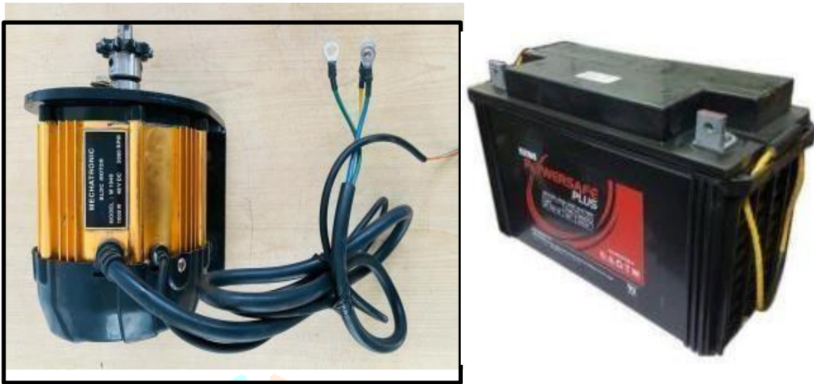
Figure 3.1 Motor and Battery used in the vehicle

vertical supports, providing necessary rigidity and strength for the electric loader application.