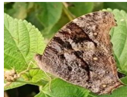
2. Melanitis phedima