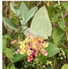
2. Catopsilia pyranthe