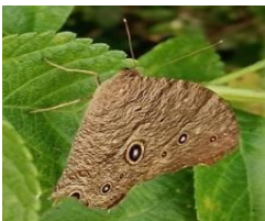
1. Melanitis leda