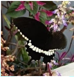
2. Papilio polytes