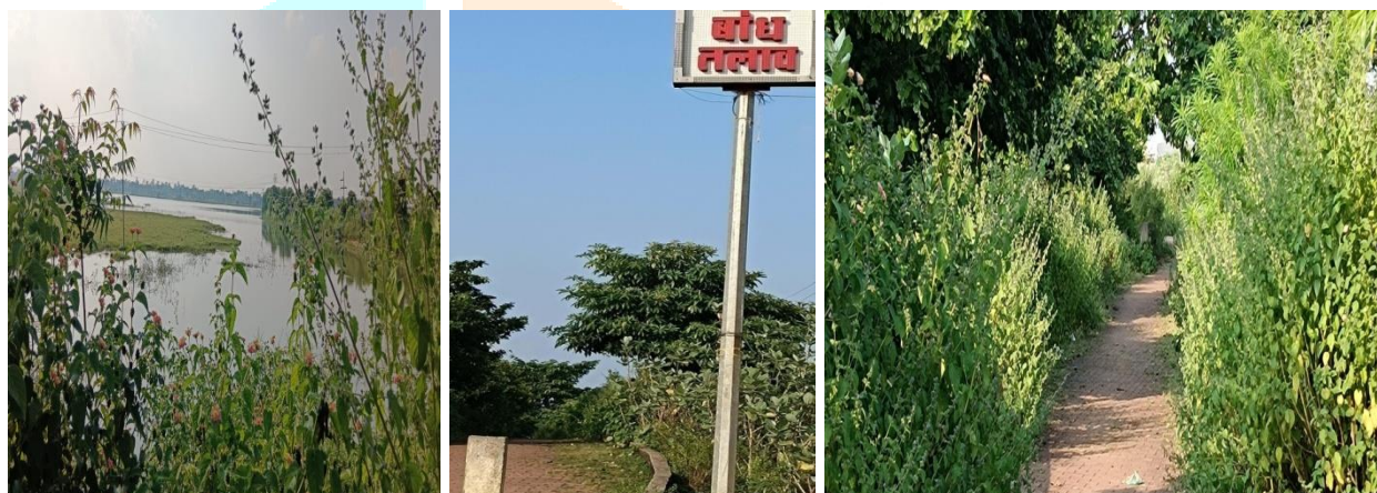
Figure 1 Bandh Talav Kudwa, Gondia

Present study was carried out in Bandh Talav Kudwa, Gondia Maharashtra. Bandh Talav is situated at eastern side of district Gondia. Bandh Talav is 1.5 k.m.away from Gondia city. Bandh Talav is located at Co-ordinates 21 0 08'N and 80 0 43'E at 228 m AMSL (Above Mean Sea Level). Gondia is a famous for rice city. Bandh Talav is surrounded by agricultural fields. The schedule was regularly survey for the period of four months from September 2024 to December 2024. The data has been observed and examined during morning, afternoon and evening. In the study area from 6.30 to 11.30 (Morning), 12.30 to 4.00 pm. (Afternoon), 4.00 to 6.00 pm. (Evening). Digital camera used for digital photography. The species were observed, reported and identified by available references. Publications, standard keys and by experts. (D'Abreau, E.A., 1931, Evans, 1932, Wynter- Blyth, 1957, Kunte, 2000, Wadatkar and Kasambe 2008, Tiple, 2012, 2023).