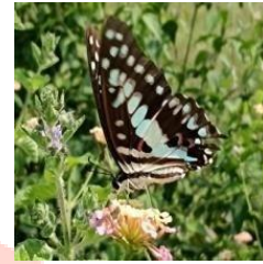
3. Graphium doson