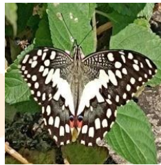
1. Papilio demoleus