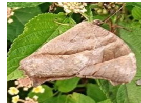
3. Melanitis zitenius