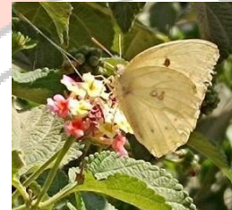
3. Catopsilia florella