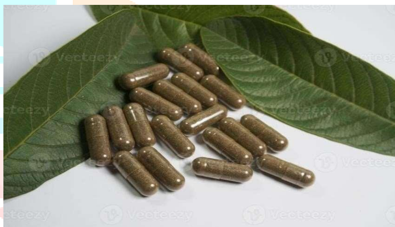
Fig 5 :Guava Capsule