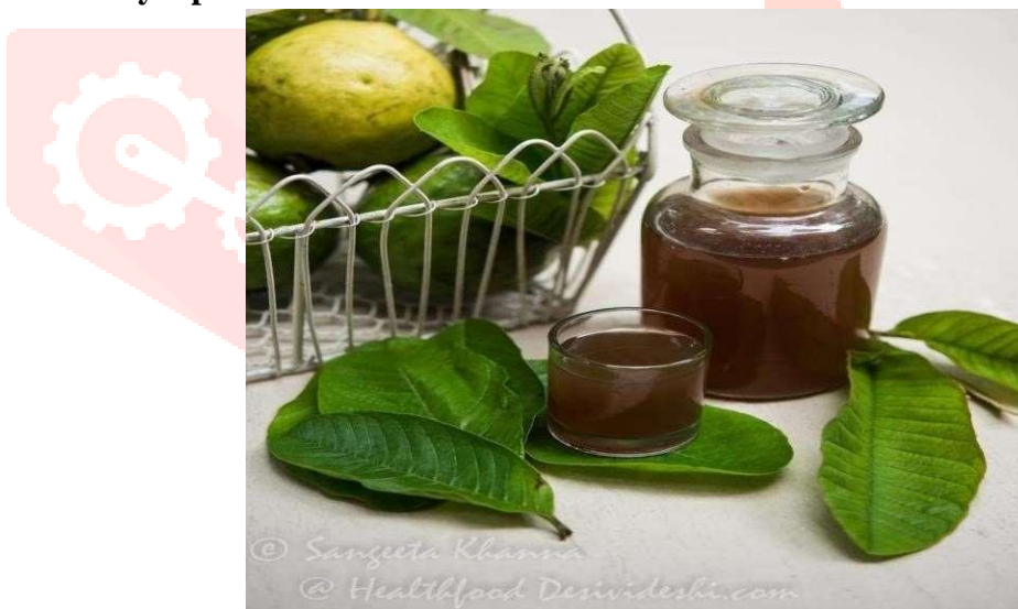
Fig3 : Guava Syrup