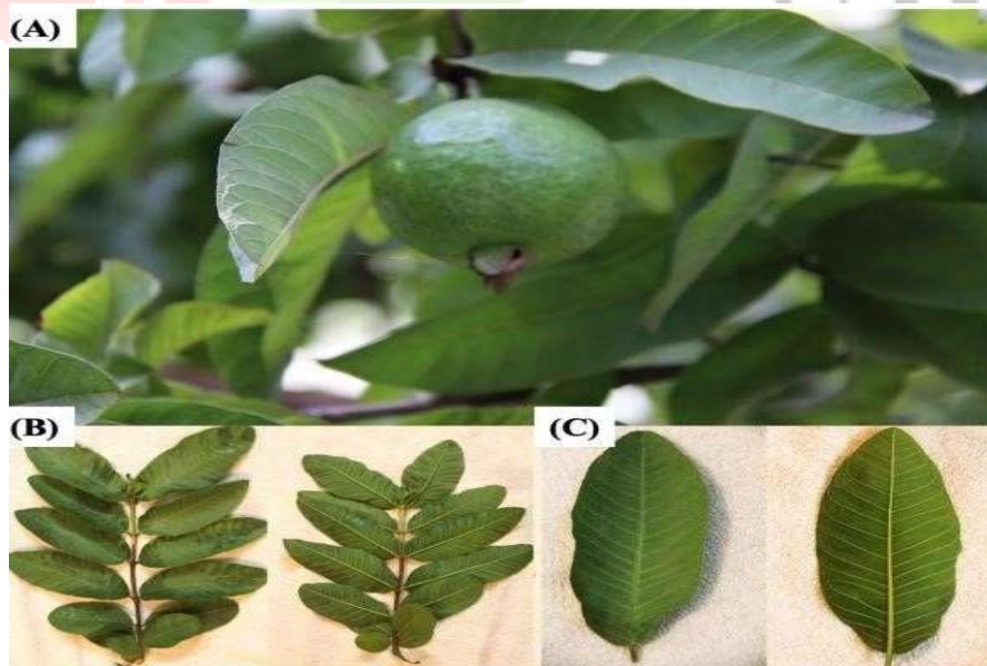
Fig 1: Guava Fruit And Leaf