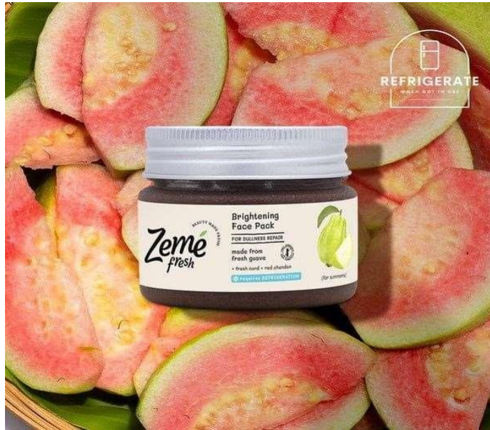
Fig 4 : Face Mask Of Guava