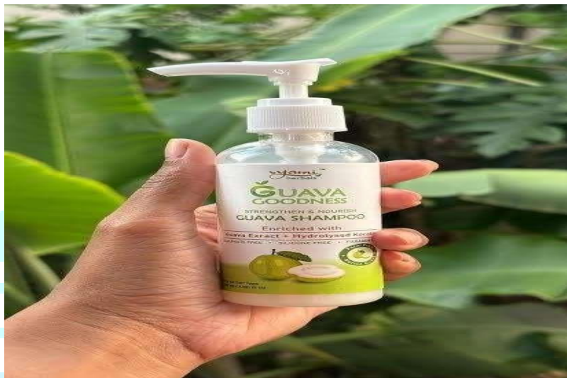
Fig No.4.Guava Shampoo