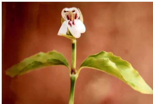
Figure 1.: Adhatoda beddomei L. flower on twig