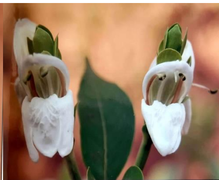
Figure 1.: Adhatoda vasica L. flowers on twig