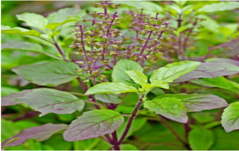
Fig. no.2. Tulsi