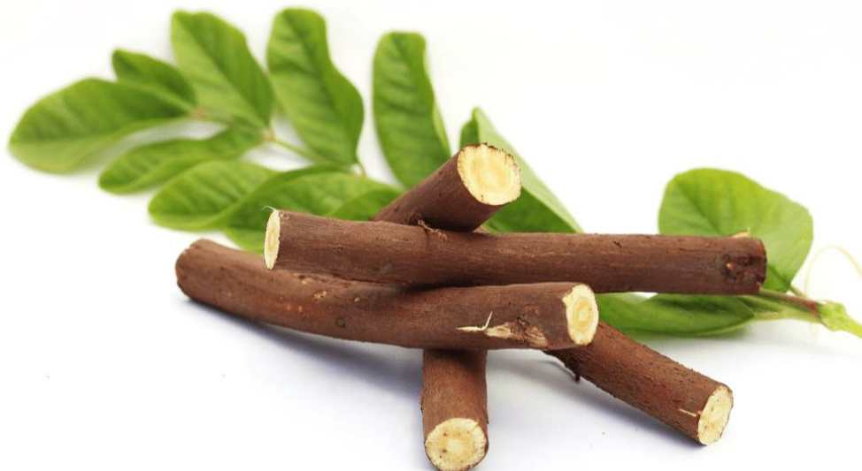
Fig. no.5. Liquorice