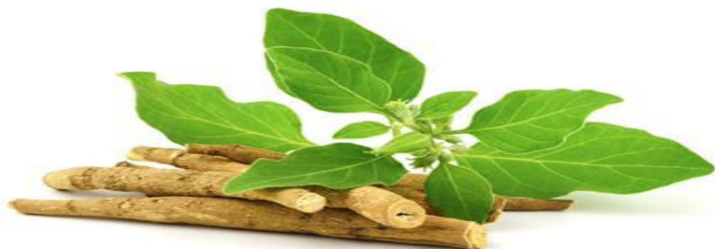
Fig. no .7 .Ashwagandha

Botanical name : Ashwagandha ( Withania somnifera fam. Solanaceae) is commonly known as “Indian Winter cherry” or “Indian Ginseng”.