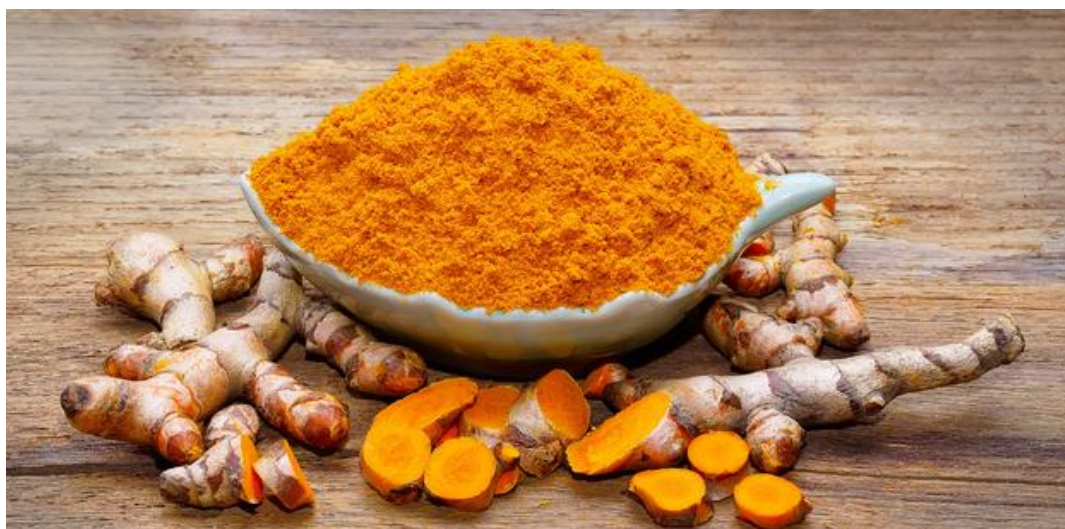
Fig. no.3. Turmeric