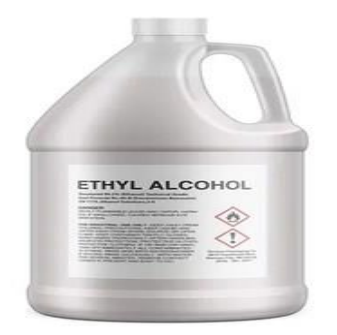
Figure No 4 – Surgical Spirit

In addition to being a cleaning agent, the Surgical Spirit Disinfectant Solution also possesses antiseptic qualities. It is given topically to the skin. Applied to the skin's surface, the Surgical Spirit Disinfectant Solution serves as both a cleansing and an antiseptic agent.Surgical Spirit works to create a tighter, more durable, and hygienic epidermis. In general, sick rooms make use of it as well. Your skin won't dry out or split thanks to castor oil. Excessive topical administration of methyl salicylate may result in absorption through unbroken skin. A multifunctional cleaning and sterilising solution, surgical spirit can be used to sanitise skin as well as surfaces. bottle with a child lock safety lid, capacity 500ml. Keep out of the heat and Cold.