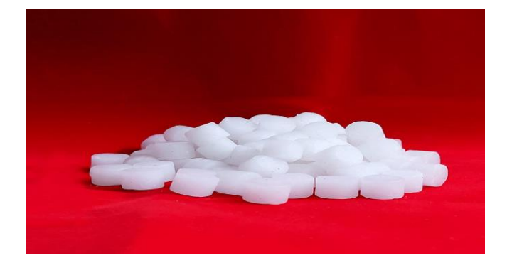
Figure No 6 – Camphor

Because of its antibacterial qualities, camphor is frequently used in sanitizers. It increases the sanitizer's efficacy by aiding in the destruction of bacteria and germs. Furthermore, camphor can add a pleasing aroma to the sanitizer composition, covering up any unpleasant chemical smells.