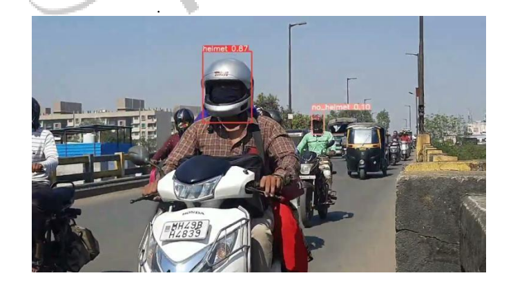
Figure 1: image detection

To Implement the system is able to detect whether motorcyclist wear helmet or not even at real time. It enables one to spot and penalize bikers without a helmet.