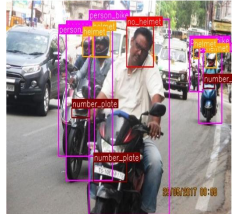
Figure 4 : Real-time automatic helmet detection

motorcyclists in real-time. This involves passing the frame through the model and interpreting the output to identify the presence and location of motorcyclists. After detection, you can perform additional post-processing steps such as non-maximum suppression to eliminate duplicate detections and improve the accuracy of the results.