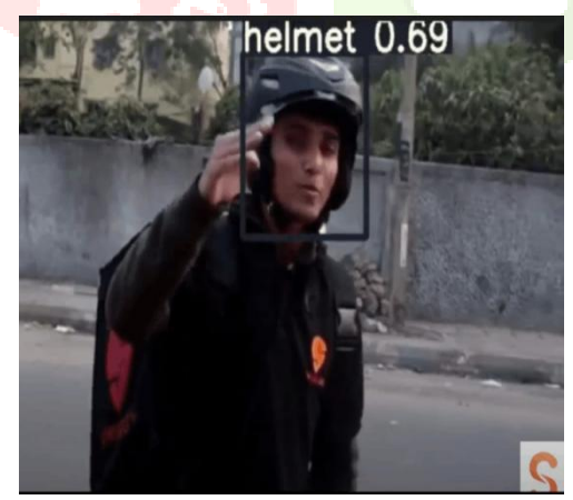
Figure 5 : Detecting wheather motorcyclist wearing helmet or not

Gather a dataset of images containing motorcyclists and background scenes. Resize and normalize the images to a consistent size, and label them accordingly.Choose a pre-trained convolutional neural network (CNN) model for feature extraction, such as VGG, ResNet, or MobileNet.Remove the classification layer of the selected CNN model and use the remaining layers to extract features from the images.Create a new classification model using Keras, consisting of the extracted features as input and a binary classification output (motorcyclist or non-motorcyclist). Draw bounding boxes around detected motorcyclists in the video feed to indicate their location.Evaluate the model's performance using a separate test dataset.