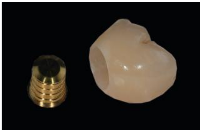
Figure 2: Crown and definitive abutment before cementation.

screw; marginal adaptation and bacterial sealing; retention force; digital approach; follow-up; and varieties of prostheses.