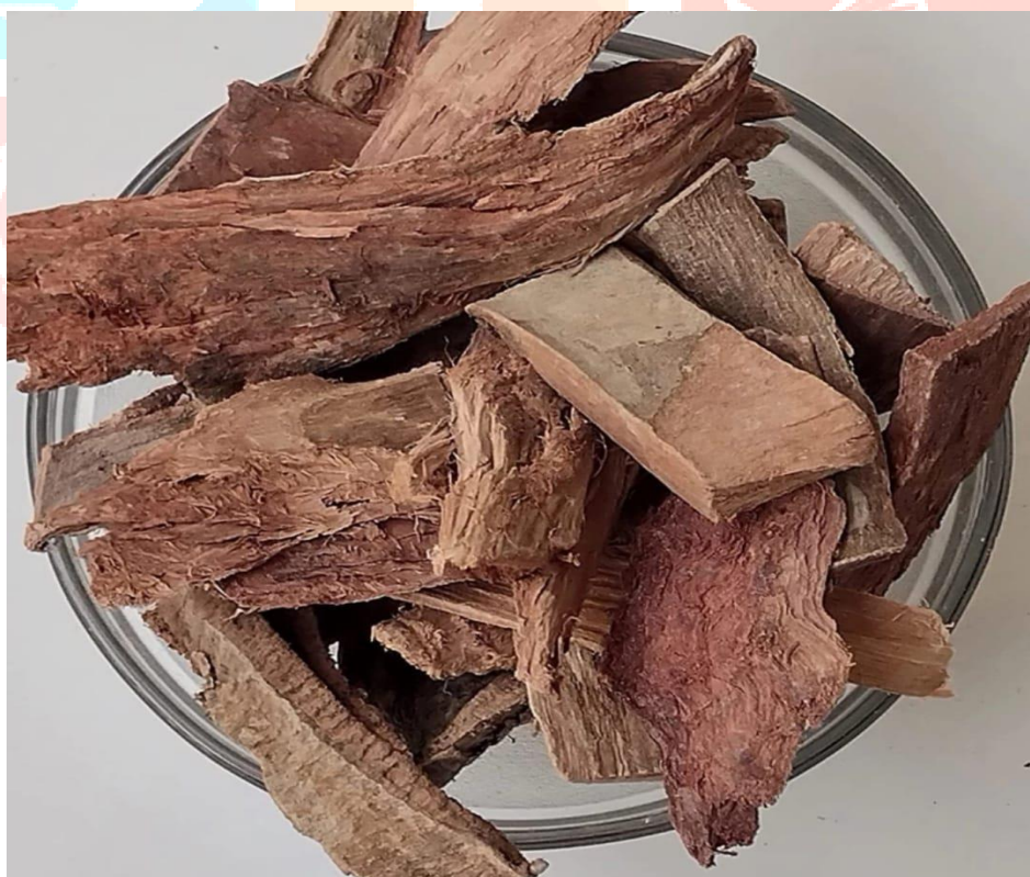
Figure 2: Arjuna Bara

Various extracts from the stem bark of Arjuna have demonstrated numerous pharmacological characteristics, including inotropic, anti-ischemic, antioxidant, blood pressure-lowering, antiplatelet, hypolipidemic, antiatherogenic, and antihypertrophic effects. This article aims to review and present current information relevant to the use of Arjuna as a potential cardioprotective agent based on these demonstrated pharmacological properties.