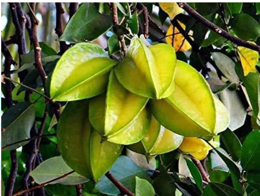
Figure 1: Arjuna fruit