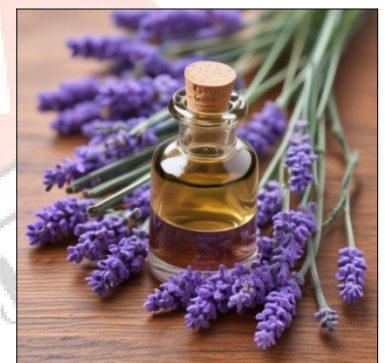
Figure.No.6: Lavender oil

Borneol: The borneol that lavender is abundant with may, among others, lead to a calming of the mind and easing Cramps.