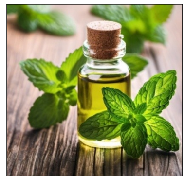
Figure.No.5: Peppermint oil