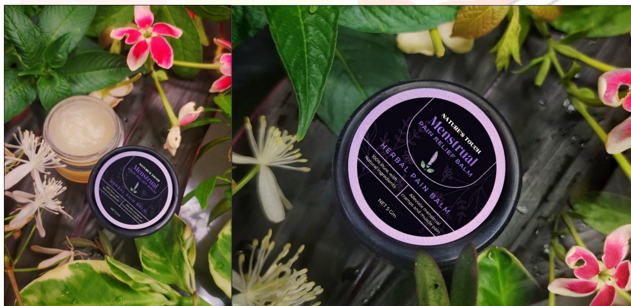
Figure.No.12: Formulated herbal menstrual pain relief balm.