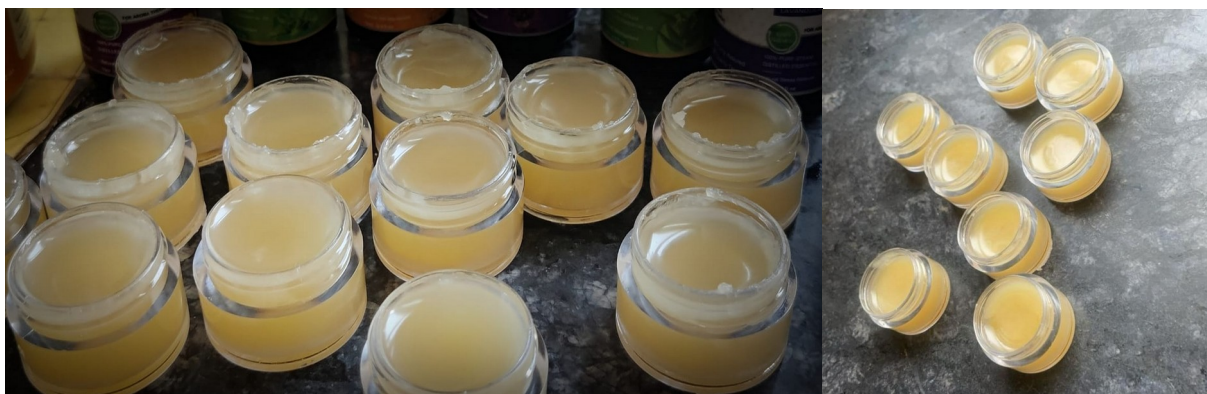
Figure.No.10. Prepared herbal menstrual pain relief balm.