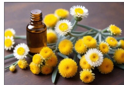
Figure.No.8: Helichrysum oil

Some of the key constituents found in Helichrysum oil include: The main characteristics that are present in Helichrysum oil include: \alpha -Pinene, \beta -Pinene, Neryl acetate, Italicone, \gamma -Curcumene, \beta -Caryophyllene, Italicene, Limonene, Linalool