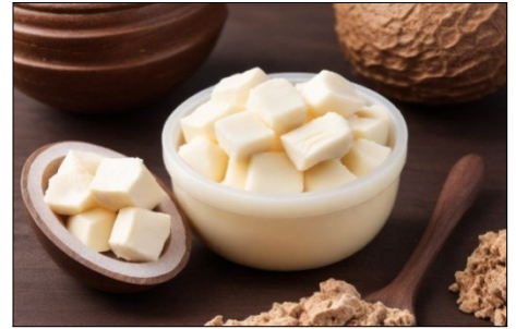
Figure.No.3: Shea Butter

Composition: Majorly consisting of triglycerides, which in turn have the main converse acids that are oleic acid(40-60%) and stearic acid (20-50%) in abundance. It is a compound consists of many other fatty acids but in smaller proportions; i.e. omega 6 (linoleic acid), saturated (palmitic acid) and polyunsaturated (arachidonic acid). Earlier, it was also observed that Shea butter is a treasure chest of bioactive compounds such as Phytosterols, Tocopherol, and Triterpenes.