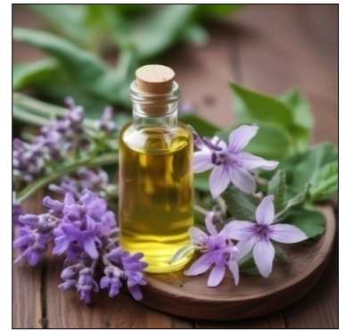
Figure.No.4: Clary Sage oil