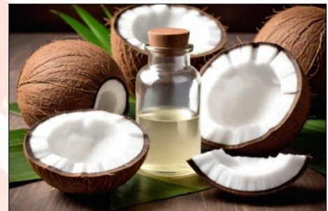
Figure.No.2: Coconut oil

Other MCFA's: Another form of MCFA's such as Myristic acid and Palmitic acid is also in coconut that give the significant impacts on health.