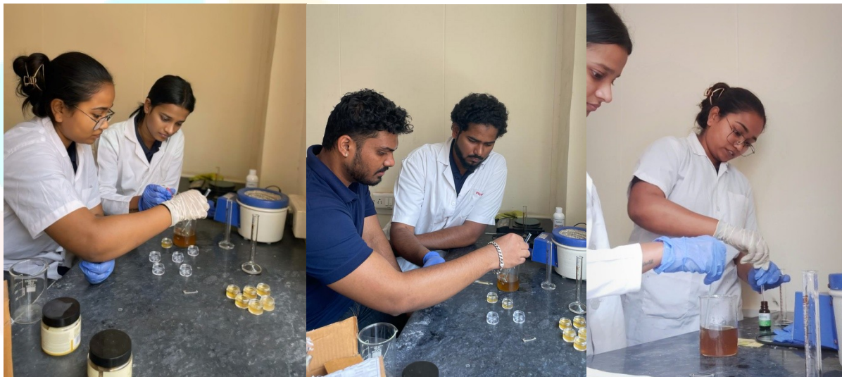
Figure.No.9: Preparation of herbal menstrual pain relief balm.

Make sure to store the pain relief balm in a clean and dry environment free from excessive sunlight and other extreme temperatures to ensure that its efficacy and shelf life is maintained.