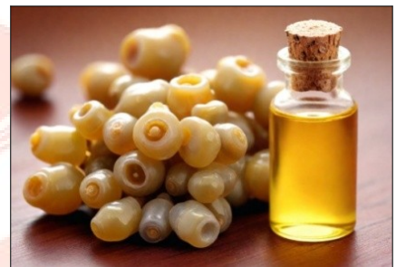
Figure.No.7: Frankincense oil