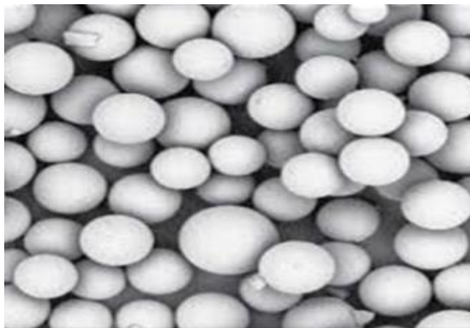
fig: 4 radioactivr microsphere

distance rather than releasing radioactivity from microspheres. The three types of radioactive microspheres are \alpha , \beta , and \gamma emitters