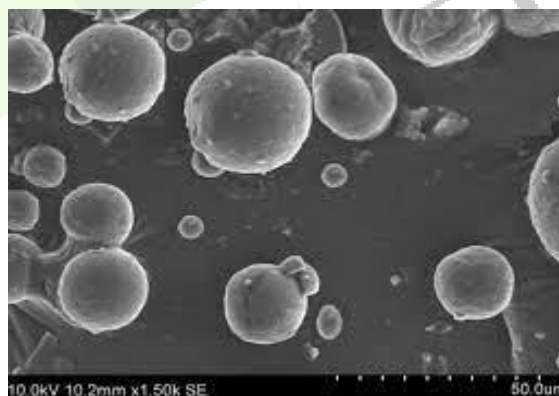
fig:3 floating microsphere