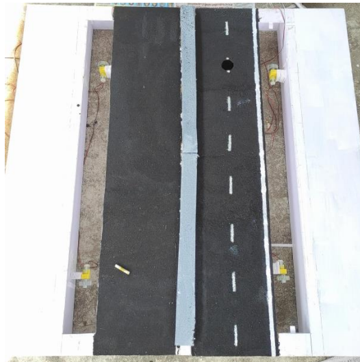
Figure No 2. Mechanism of Rack and Pinion and Mini Gear Motor

The proposed model consist of a four-lane road each of 7.5m with kerb, a divider of 1.5m, footpath of 3m on either sides and a walkway or pedestrian walk of 1m. the whole layout is scaled down to 1:30 based on IRC specifications.