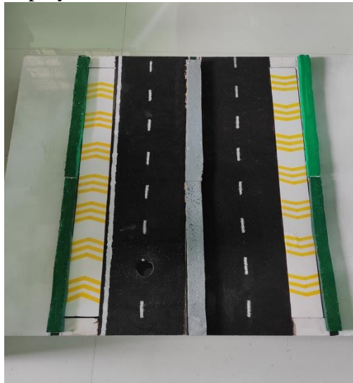
Figure No 3.Completed Model

4. Prototype Development* : Build a prototype of the movable footpath using scale models to test functionality, durability, and ease of deployment.