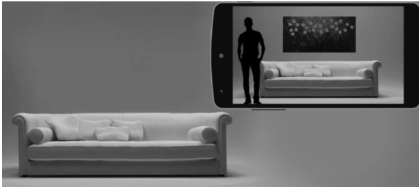
Fig. 4. Virtual Trail

Using the method of augmented reality (AR), an individual can practically position an artwork on their wall, adjust the brightness and reflecting projection, and choose the artwork from their mobile device. This is known as a simulated pathway. In order to accurately depict what is presented to the individual, an individual's outline measuring six feet in height will serve as a reference point for adjusting the artwork's dimensions.