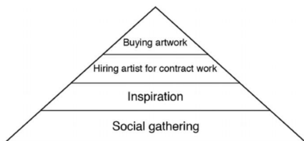
Fig. 2. Motive of audience while visiting an art-gallery

The main obstacles that art enthusiasts suffer are as follows: