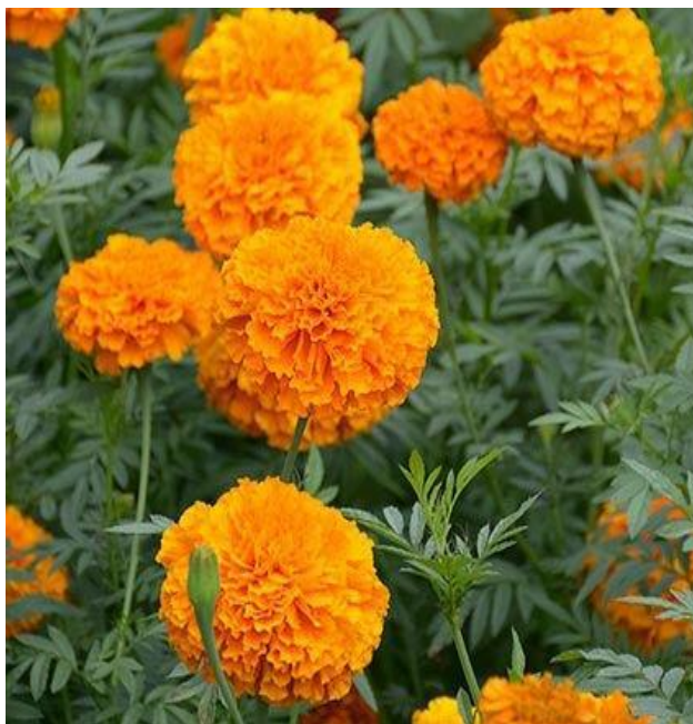
Fig. No. -5 Marigold