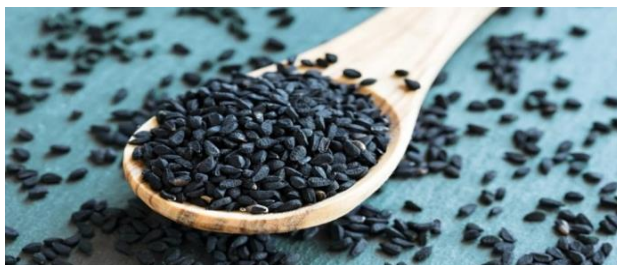
Fig. No. -4 black cumin