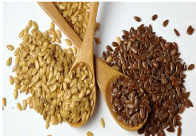
Fig. No. – 3 flaxseed