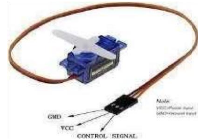
Figure:4 Servo Motor

motors to rotate extremely precisely. Utilising a servo motor allows you to spin an object at precise angles or distances. All that's involved is a basic motor that powers a servo mechanism. When a motor is powered by an AC power source, it is referred to as an AC servo motor; otherwise, it is called a DC servo motor.