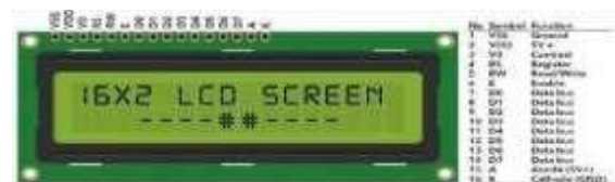
Figure:5 16*2 LCD Display

A type of electronic display module called a 16*2 LCD display is utilised in a wide range of circuits and devices, including TV sets, computers, calculators, and cell phones. Seven segments and multi-segment light-emitting diodes are the major applications for these displays. The primary advantages of utilising this module include its low cost, ease of programming, animations, and unrestricted display of unique characters, special effects, and animations, among other things.