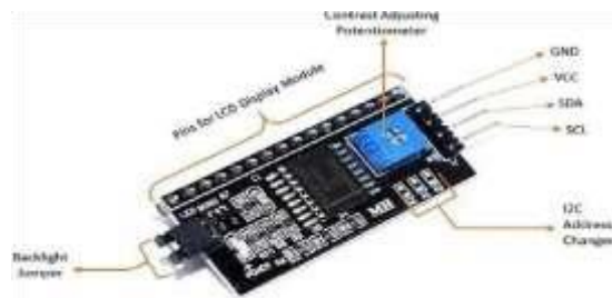
Figure:6 I2C Module