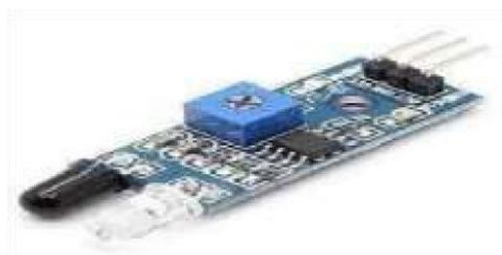
Figure:3 Infrared Sensor(IR Sensor)

An electrical gadget called an infrared sensor emits Obtaining an order to feel certain features of the environment is the second procedure. a parking spot in IR. In order to keep the parking lot maintained, sensors that monitor object heat and orderly sensors that detect motion from cars are both used. Rather than emitting it like sensors on the parking sign, these sensors measure the amount of infrared radiation that is extra and installed in each parking space. Every spot in the parking lot contains a unique device known as a passive infrared sensor. Typically, every device emits some kind of data, and the infrared address system will send the most recent spectrum. in order to be updated if an automobile is discovered at a designated slot address, to the cloud. The process of leaving the parking spot is the following step. The second technique and this one are almost the same. A sensor notifies the system when a car is observed pulling out of a certain parking spot, and the system adjusts the cloud-thermal radiation.