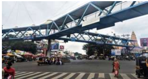
Fig No 3: - FOB at Vishrantwadi