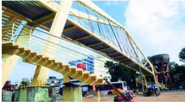
Fig No 1: - FOB at Bhosari