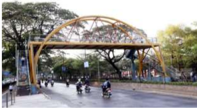
Fig No 2: - FOB at Chinchwad