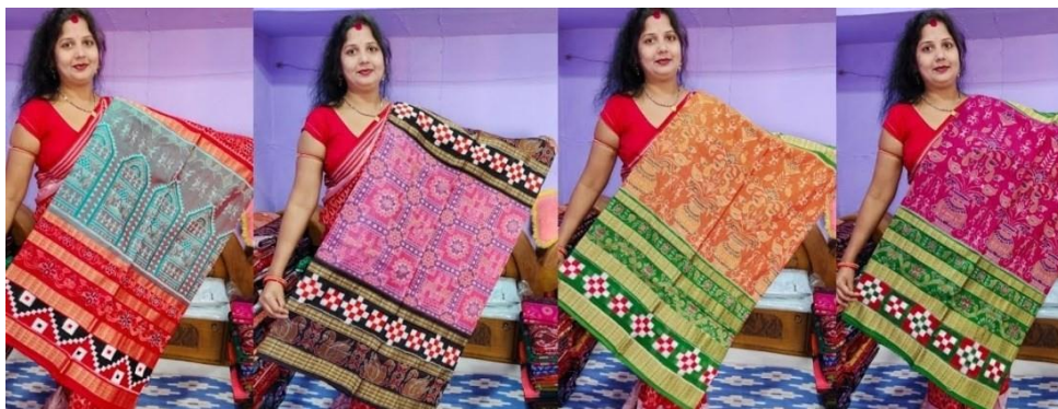
(You tuber Vlogger exhibiting the elegance of Sambalpuri sarees)

They feature Sambalpuri handloom on their channels, promoting it within the fashion industry and throughout Odisha, India, and globally. Their efforts have sparked widespread interest in Sambalpuri sarees, even among foreigners, who have developed a fondness for them. By showcasing the intricate designs and craftsmanship of Sambalpuri handloom, these YouTuber women contribute to its recognition and appreciation on a global scale. Their advocacy not only boosts the local economy but also preserves a centuries-old tradition, enriching the cultural heritage of Odisha and fostering connections with enthusiasts worldwide.