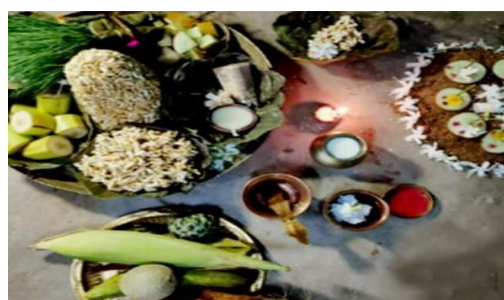
(Pua Jiuntia Puja for Son and Bhai Jiuntia puja for brother)