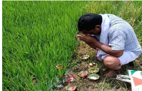
(Nuakhai: Ritualistic offering & feasting in Western Odisha)