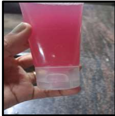
Fig.8. Formulation Of Herbal Antiacne Facewash

sulphate and propyl paraben. To this add a sufficient quantity of rose water. Then the Prepared formulations were filled in a suitable container and labeled accordingly.