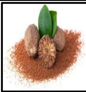
Fig.2. Beet Root