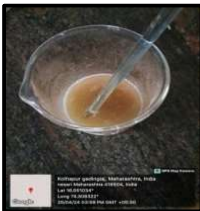
Fig.7. Gum Tragacanth

1) Various batches of formulations were prepared according to the table. The desired quantity of gelling agent i.e., Gum Tragacanth was weighed accurately and dispersed in hot rose water (not more than 60 degrees:50% weight of the batch size) with moderate stirring in order to avoid air entrapment and allowed to soak overnight. [3]