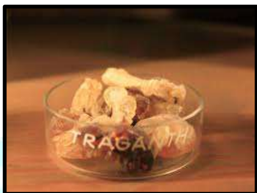
Fig.4. Gum Tragacanth