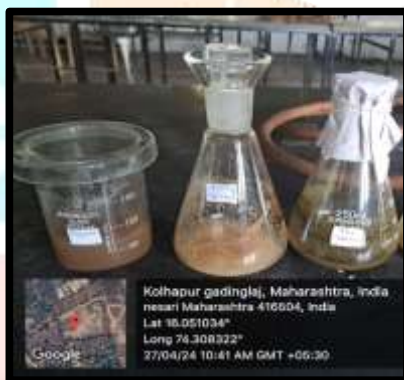
Fig.6. Herbal Extract

Herbal extracts can be prepared by the maceration method by using rose water used as a solvent. Tulsi leaves, Turmeric Powder, orange peel, beet root were kept in a hot air oven for drying purposes at 45°C and ground into small pieces by using a grinder. Desired quantities of the herbal drug were weighed and each herb macerated with rose water in a conical flask. Dried herbs were allowed to mix with rose water by moderate shaking of the conical flask for 3 days separately. After 3 days, contents were filtered out by using a simple filtration method, and filtrates were collected in vessels separately. [3]