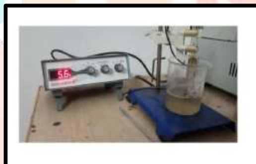
Fig:14 pH Meter