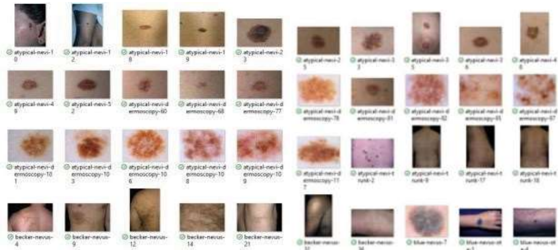
FIG.3-Different Types Of Skin Diseases