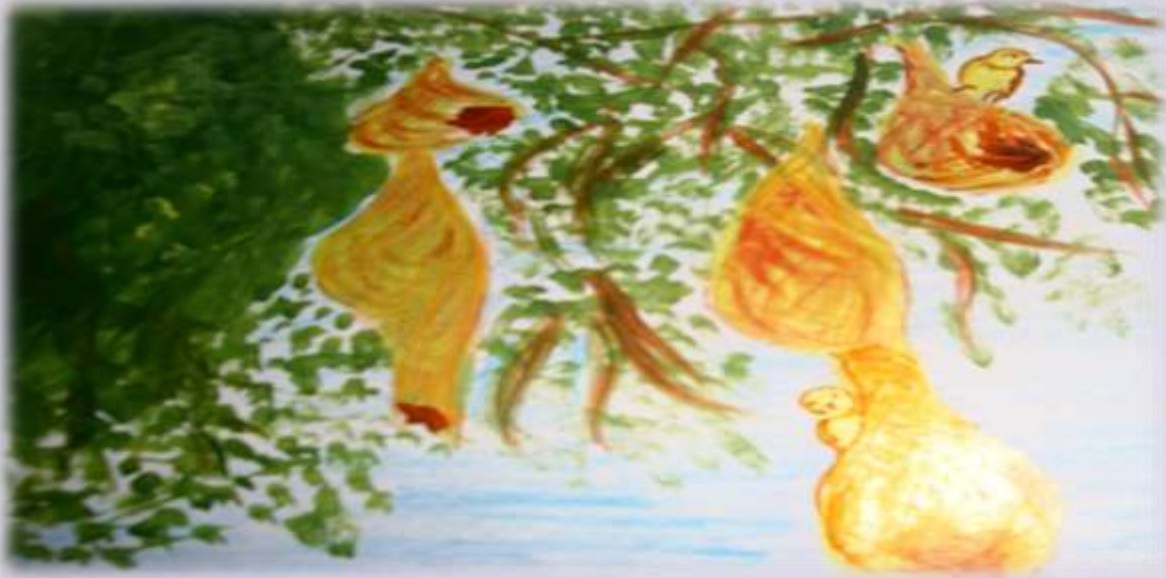
PLATE-12 ( NEST OF BAYA WEAVER IN ART (DOUBLE STORIED)