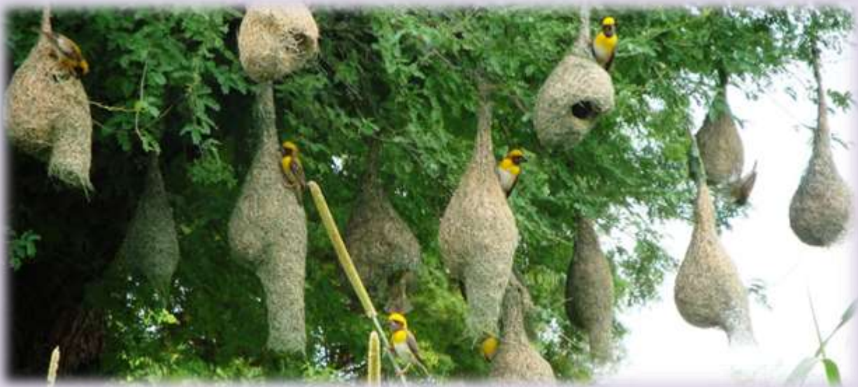
PLATE-9 ( NEST COLONY WITH NORMAL AND ABNORMAL) NEST