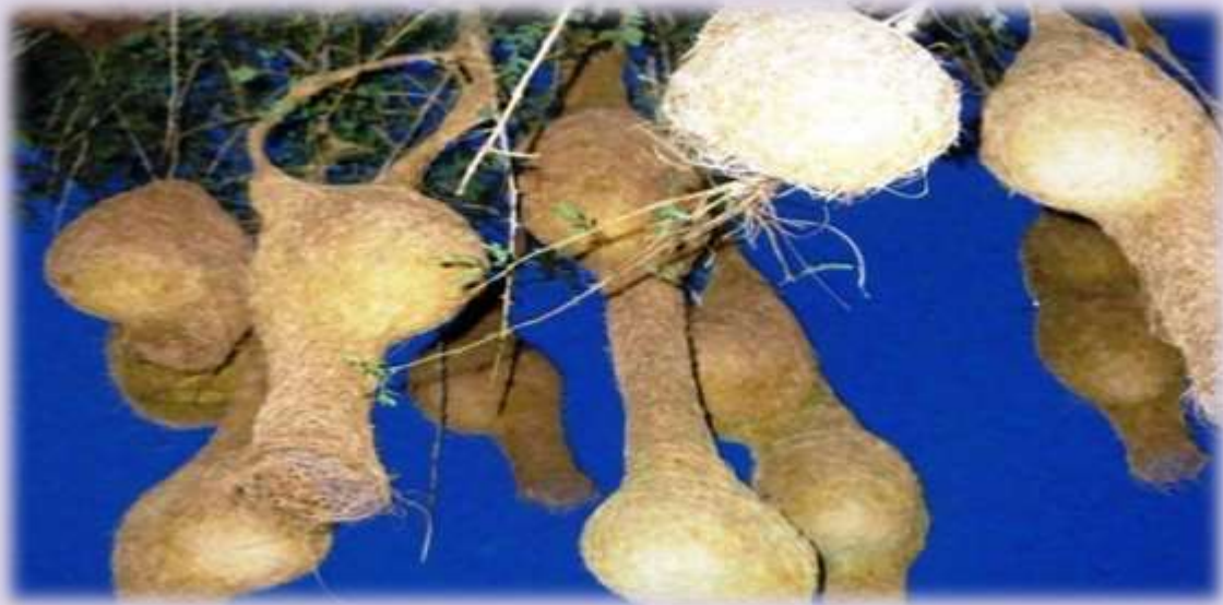
PLATE-2 (MULTISTALKED NEST)