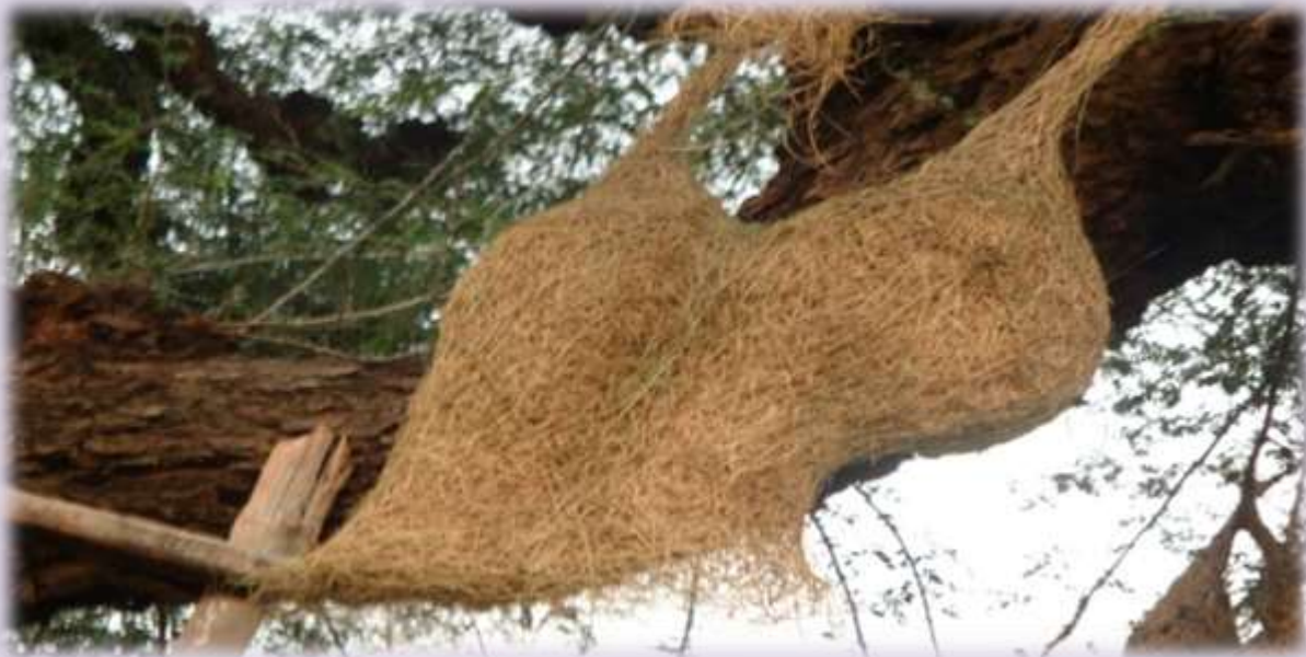
PLATE-3 (JONT NEST)