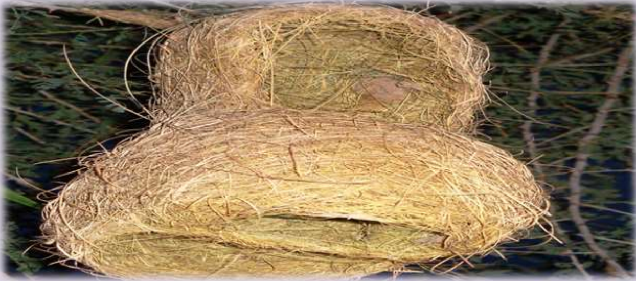
PLATE-10 ( DOUBLE OPENING ENTERANCE NEST)