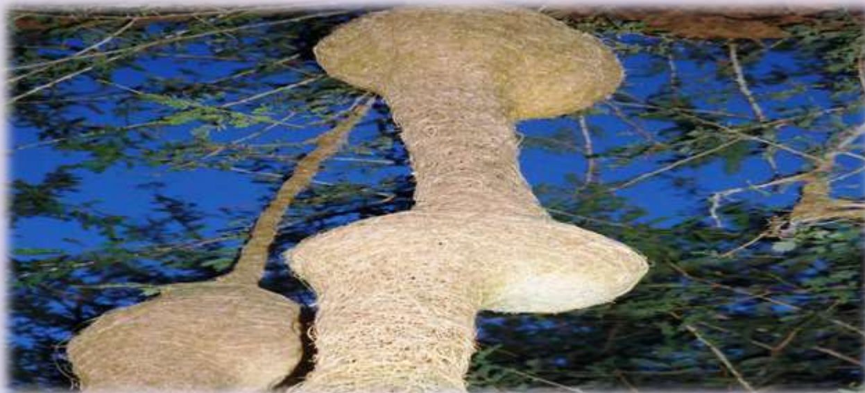
PLATE-6 (DOUBLE STORIED NEST (LONG ENTRENCE TUBE))