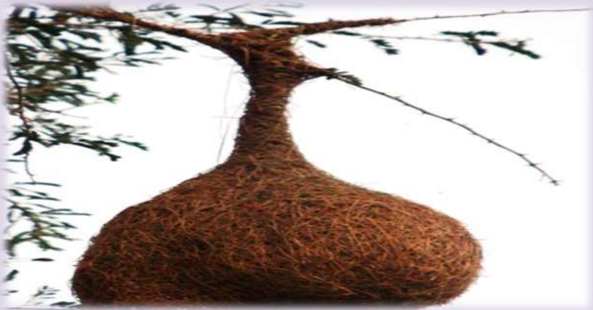
PLATE-8 (MULTISTALKED NEST)