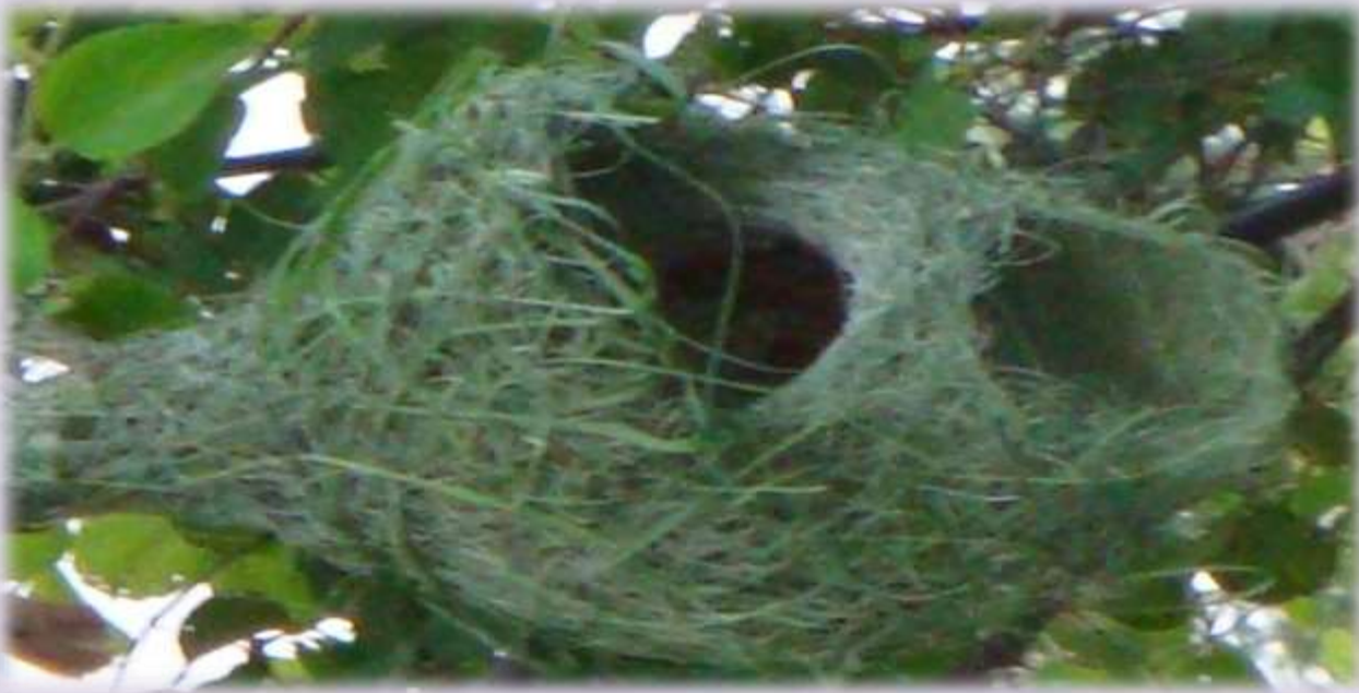
PLATE-11 (BISTORIED NEST)