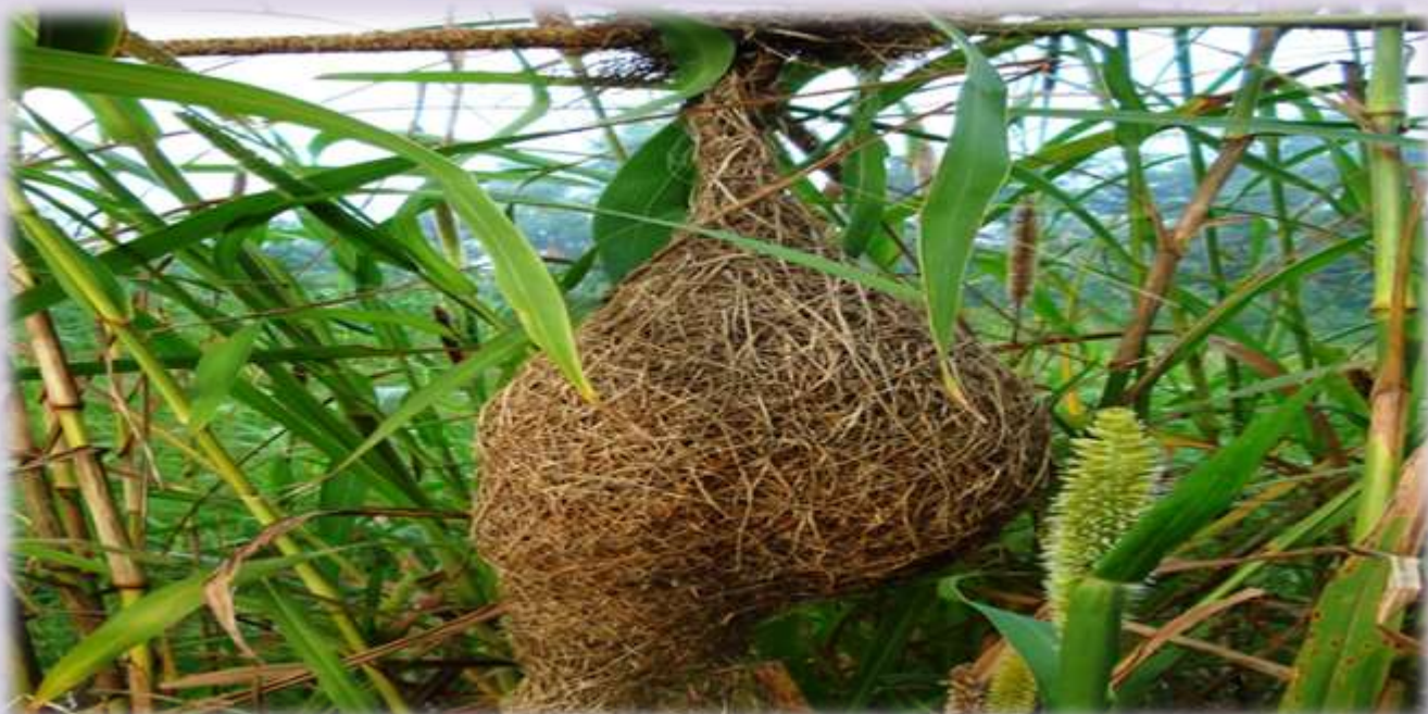
PLATE-7 (NESTING ON BAJARA (ABNORMAL NESTNG))