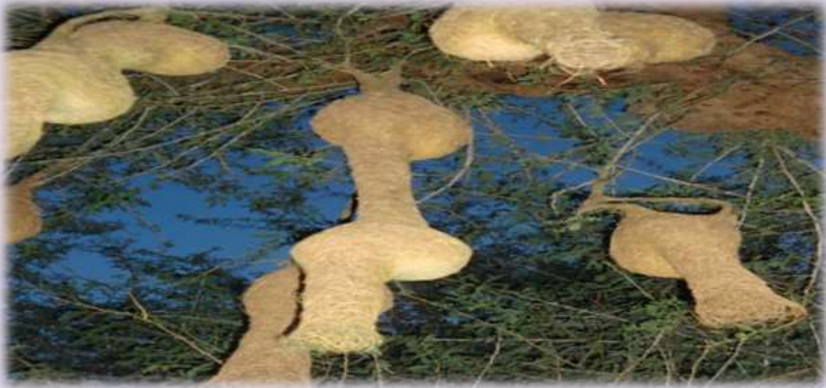
PLATE-4 (MULTISTALKED NEST)