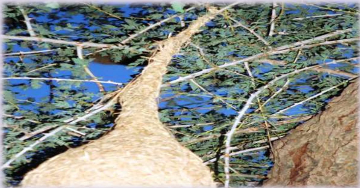
PLATE-5 (CROWN SHAPE NEST)