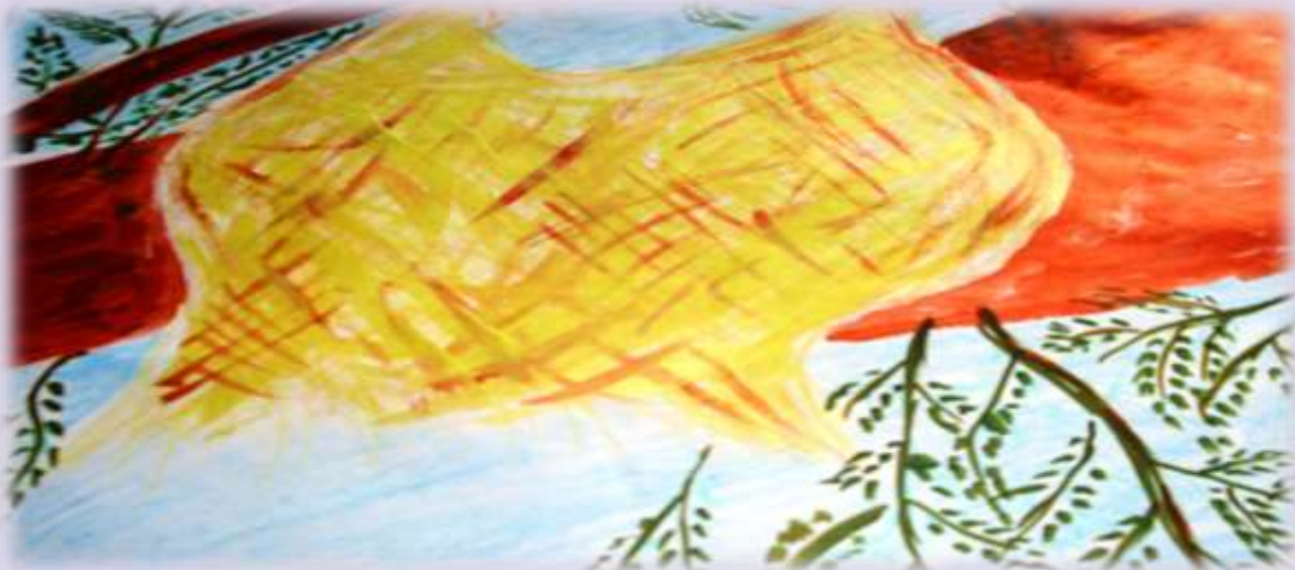
PLATE-13( NEST OF BAYA WEAVER (JOINT NEST) AS A ART)