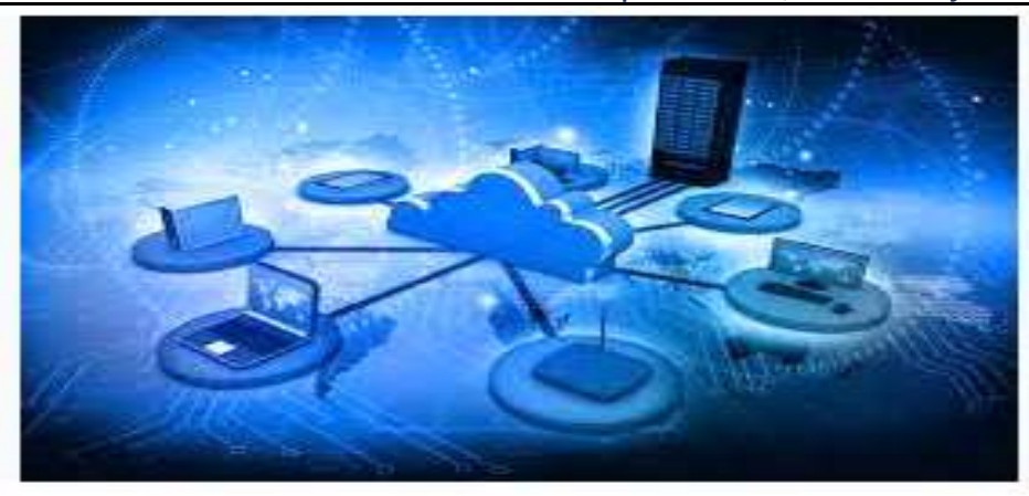
Fig:02 Cloud Computing

(adopted by www.google.com/search?sxsrf=AB5stBhfKhvjXHmVvQm1l3nbajiXreDUSg: )