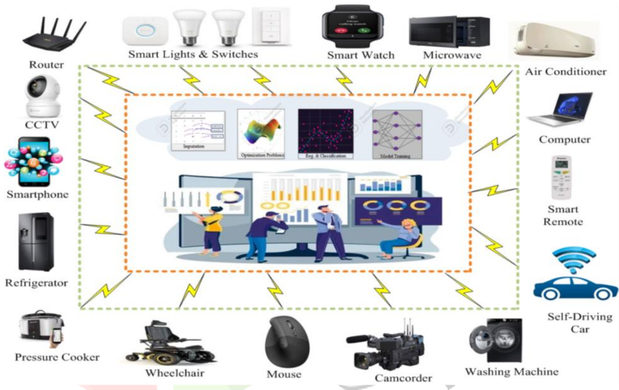
Fig. 2. The architecture incorporating IoT and data science. The outer layer is the IoT data collection layer, the middle layer shows the network layer, and the inner layer shows the computational layer.

The Intelligent Internet of Things (IIoT) builds upon the foundational principles of IoT by integrating advanced artificial intelligence (AI) and machine learning (ML) techniques. This integration enhances the capabilities of traditional IoT systems, enabling more reliable and secure monitoring and decision-making. IIoT systems are designed to improve operational efficiency and minimize disruptions through predictive analytics and automated responses. They leverage deep learning and ML algorithms to process and analyze the vast amounts of data generated by IoT devices, transforming raw data into actionable insights. Moreover, IIoT systems prioritize security, incorporating measures to protect against network attacks, ensure data confidentiality and integrity, and maintain a secure environment for data transfer. By combining IoT's connectivity and sensing capabilities with AI's analytical power, IIoT represents a significant advancement in creating intelligent, efficient, and sustainable systems [16].