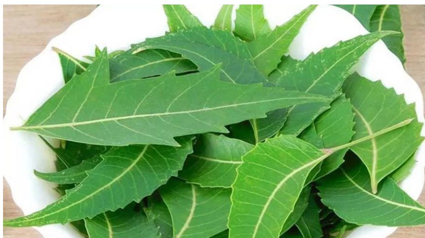
Figure 3,Neem leaves