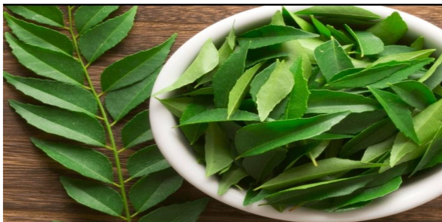
Figure 4. Curry leaves

Scientific Name :- Murraya koenigii or Bergera koenigii .