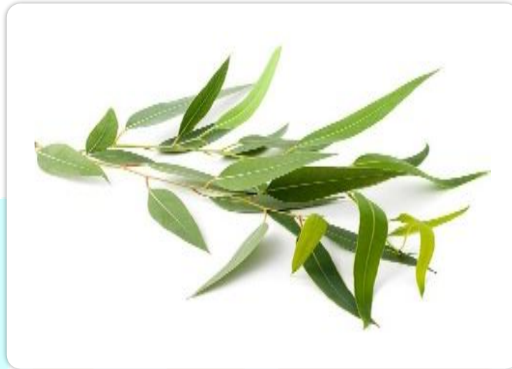
Figure 8, Eucalyptus plant leaves

Scientific name:- Eucalyptus teriticornis .