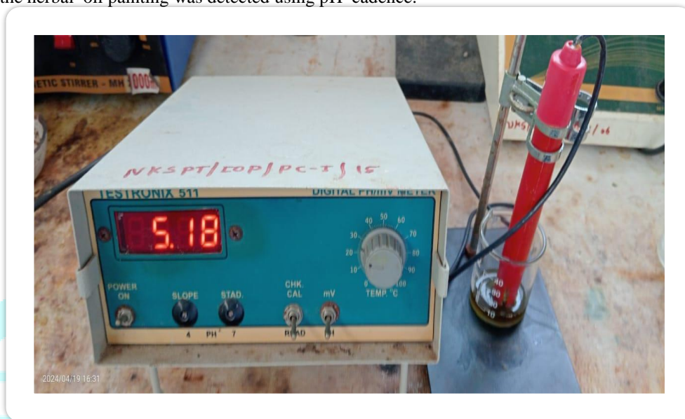
Figure 11, PH meter