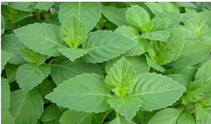
Figure 5. Tulsi leaves