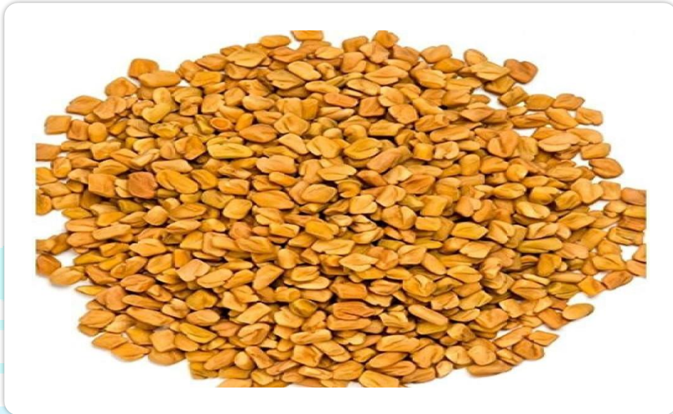
Figure 6, Fenugreek seeds

Scientific Name: Trigonella foenum-graecum