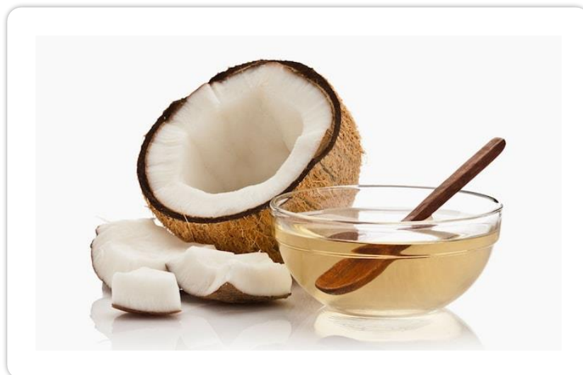
Figure 9, Coconut oil