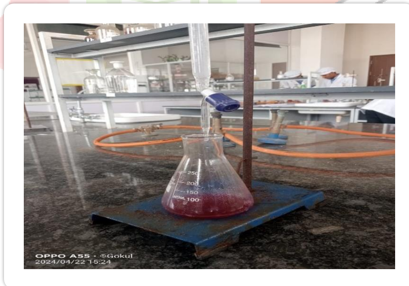
Figure 12, acid value titration