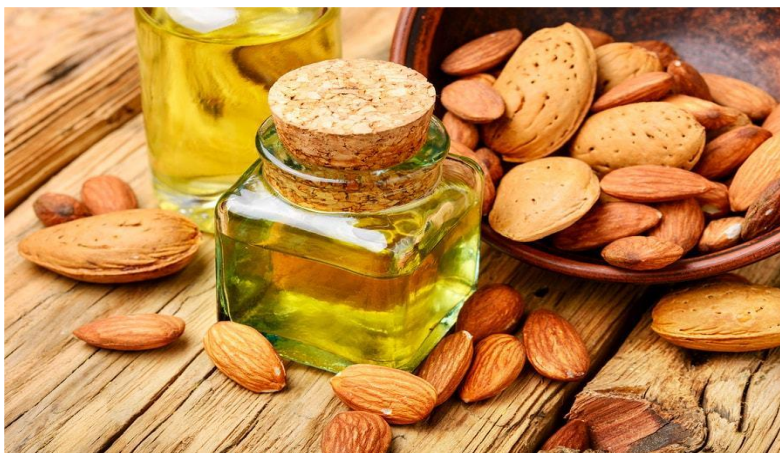
Figure 10, Almond oil.