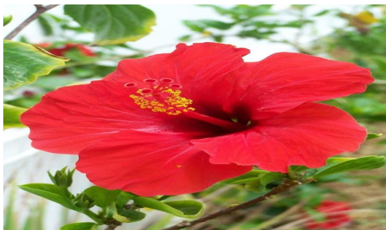
Figure 2, Hibiscus flower

Scientific Name: Hibiscus rosa-sinensis.