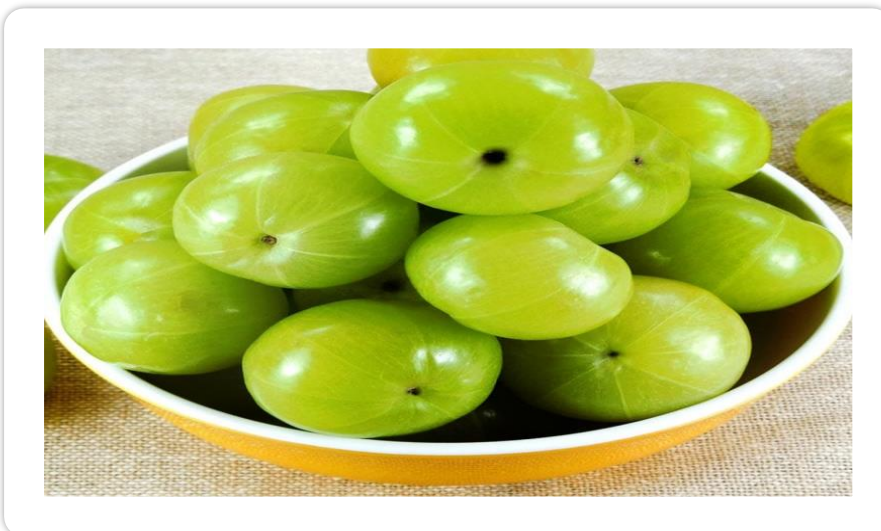
Figure 7, Amla