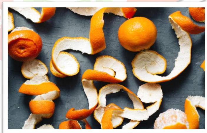
Fig no 11: - Orange peel

Orange peels emit a joyful and invigorating energy that fosters successful partnerships. According to legend, giving oranges to friends and family is a sign of closeness and love. Dried orange peels or seeds, which are frequently included in prosperity powders and love sachets and are excellent for usage when you can't decide, especially when it comes to love-related concerns, are a favourite among all types of witches. Orange peels have a powerful aroma that binds people to angels and the spiritual realm. It keeps us focused on our objectives without losing sight of the most important aspects of life by serving as a reminder of the Sun's promise. Additional phenols in orange peels, such as coniferin and chlorin, have been proven to help in radical scavenging when taken in the form of orange peel molasses. Orange peel, a citrus fruit covering, contains a variety of nutrients like vitamin C, calcium, potassium, and magnesium. It protects oppose to oxidative stress, skin dehydration, and free radical injury.