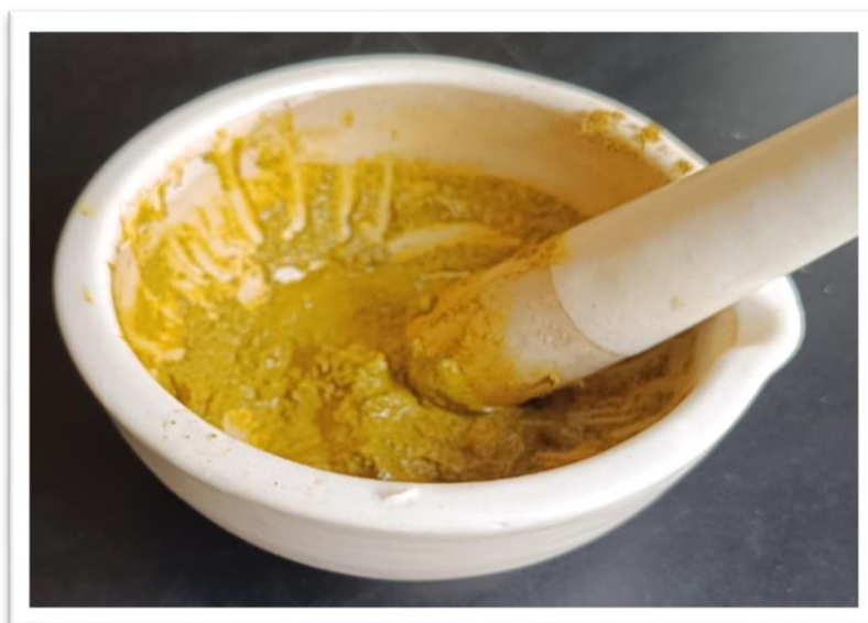
Fig no 17: - Preparation of face pack