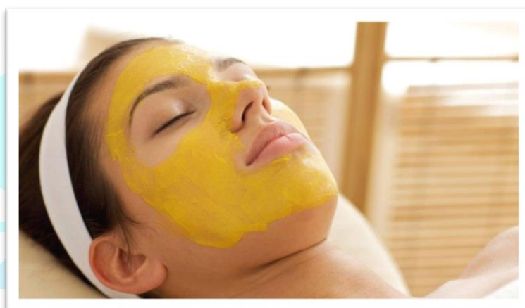
Fig no 2: - Applying Face Pack