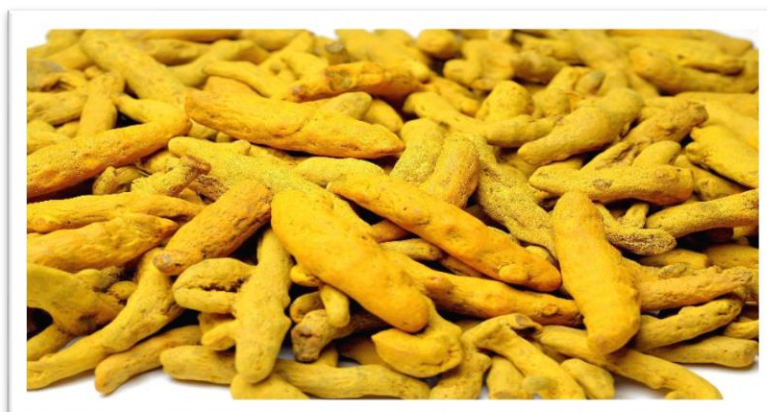
Fig No 7: - Rhizomes of Turmeric

Turmeric, also known as haldi, is a common food colorant that has been used in India for centuries. Besides, turmeric is a popular ingredient that plays a key role in daily skin care. The benefits of haldi or turmeric face packs include fighting acne and keeping your skin radiant. But if you are unsure about making one, you have come to the right place. Read this article to learn about its potential benefits and the tips to keep in mind while using haldi face packs.