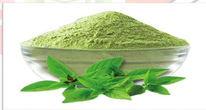
Fig no 5: - Powder of Tulsi

Botanical Name: Ocimum tenuiflorum or Tulasi