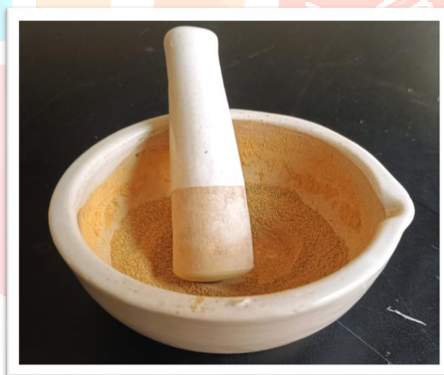
Fig no 16: - Powder Mixture of All Ingredients

Step 2. The herbal drugs such as Tulsi, Turmeric, rice flour, neem, Multani mitti, orange peel were transferred to mortar and pestle and triturated.