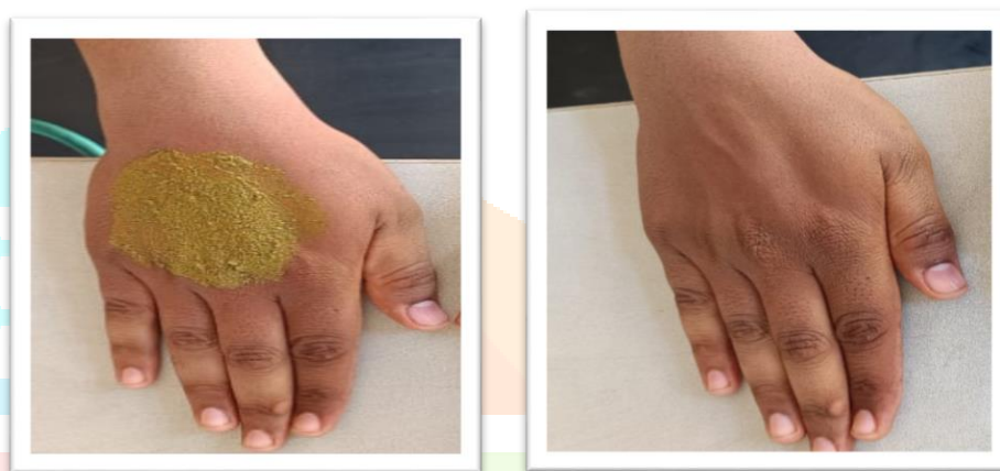
Fig no 18: - Result of Before and After applying Face pack