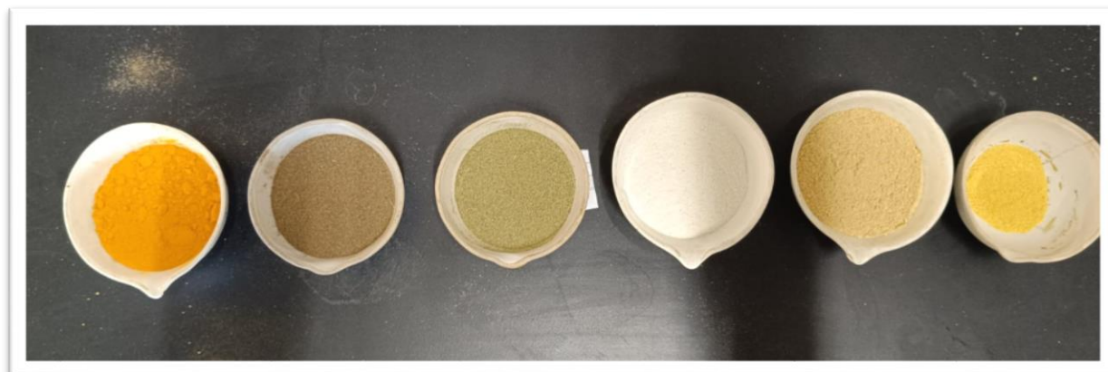
Fig no 15: - Powder of All Ingredients