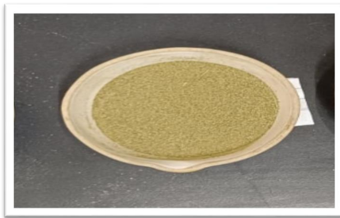
Fig no 14: - Neem Powder