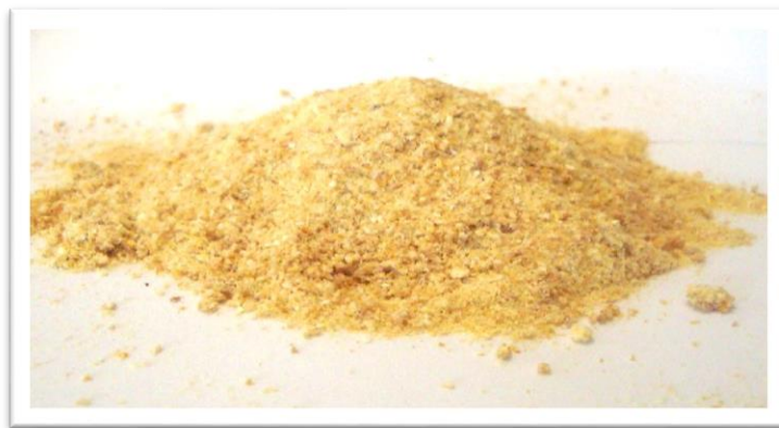
Fig no 12: - Powder of Orange peel

Botanical name: Citrus sinensis (sweet orange) Citrus aurantium (bitter orange)