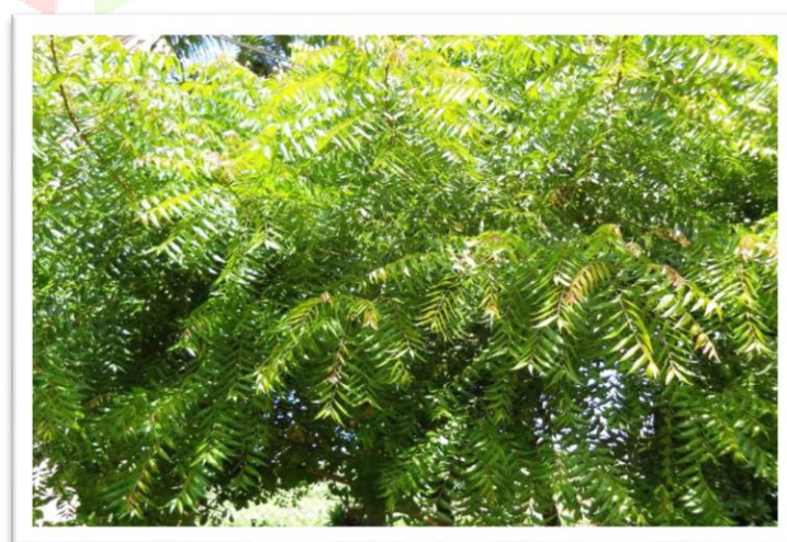
Fig no 13: - Leaves of Neem

It is encouraging to see how a traditional Indian plant remedy has developed into a number of therapeutically and commercially useful preparations and chemicals, which gives scientists considerable motivation to learn more about this medicinal plant. Exploring the chemistry of various neem sections have already been the subject of a sizable amount of research over the past few decades. Neem and its products should be the subject of in-depth research and development for greater commercial and medical applications.