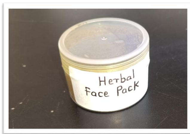
Fig no 1: - Preparation of Face Pack