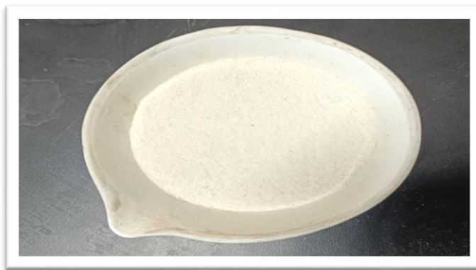
Fig no 10: - Powder of Rice flour