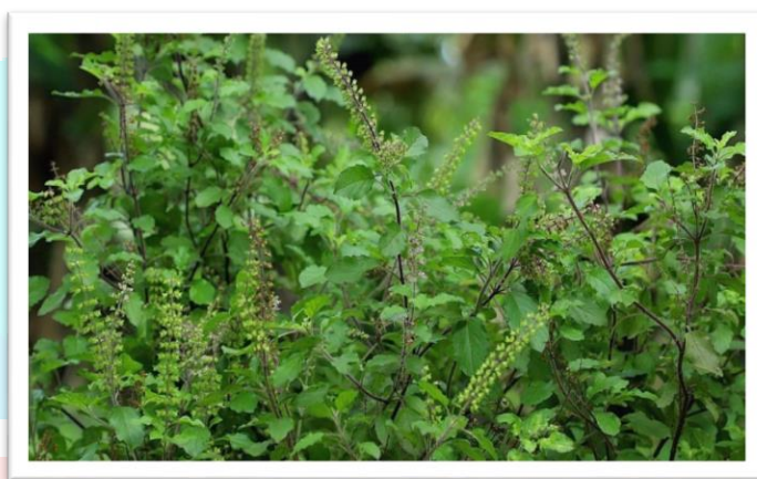
Fig no 4: - Leaves of Tulsi

The use of plants as sources of medicines are human substance has been in vogue since antiquity. Large numbers of plants are utilized in various systems of medicine practiced in India and local health traditions for the treatment of human diseases since time immemorial. Among the plants known for medicinal value, the plants of genus Ocimum belonging to family Lamiaceae are very important for their therapeutic potentials. Tulsi is the leaves of Tulsi have been mixed with stored grains to repel insects.