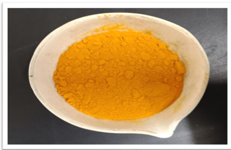
Fig no 8: - Powder of Turmeric Powder