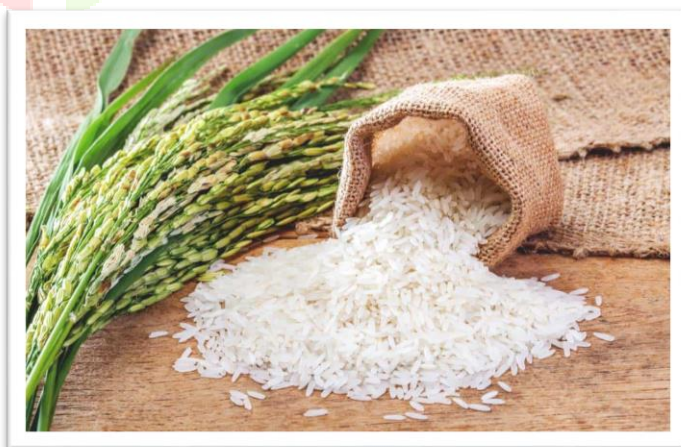
Fig no 9: - Rice

One of Rice flour's numerous advantages is that it absorbs extra skin oil, which is just one of its many advantages. Here is a simple treatment for oily skin with atta. Remove toxins, lessen tan and dark spots, and enhance the elasticity and brightness of your skin. Additionally, you will be nourishing your skin with an entirely natural substance. Numerous skin conditions are brought on by oily skin. Blackheads and dead skin cells are common skin care problems for those with oily skin. In this case, a face pack made of wheat flour might help you get rid of the issue. The rice face mask eliminates these issues by lowering skin oil production.