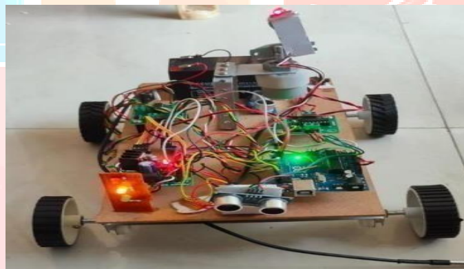
Fig 3 laser shot on detection of unknown person