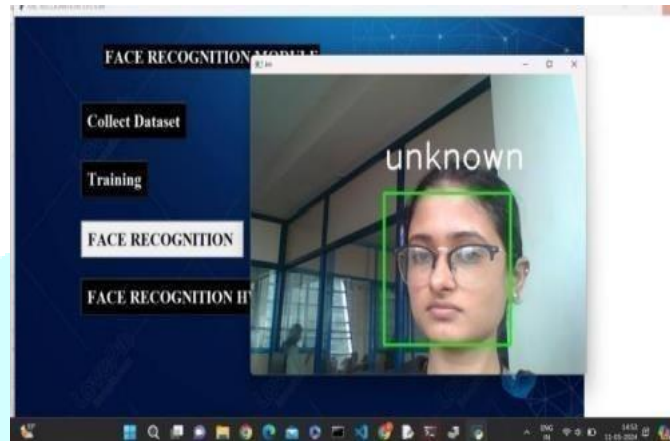
Fig 2 Detection of unknown person

The expected outcome is an integrated system that can detect missile threats, assess their trajectories, and automatically initiate interception or destruction measures. The system will also provide user-friendly hand-gestured control. The research aims to improve response times and accuracy in countering missile attacks while enhancing the human-machine interface. Fig 2 shows the unknown person detection which is classified as unknown based on soldiers face datasets. Fig 3 shows the laser light target on unknown person.