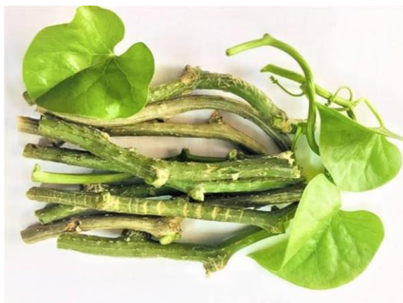
Fig. 1 Giloy Stem