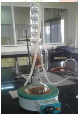
Fig.6 Giloy soxhlet extraction