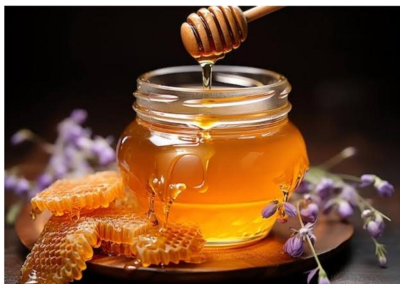
Fig. 5 Honey