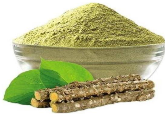
Fig. 3 Giloy