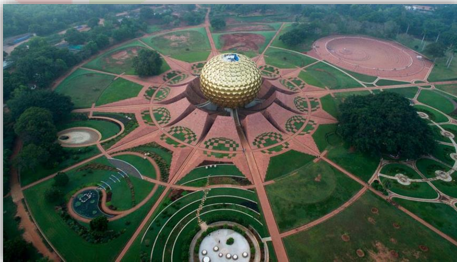
AUROVILLE, TAMIL NADU

Auroville's emphasis on community living fosters social interaction, support networks and a sense of belonging among residents. The layout of the village encourages walking and cycling, pedestrian paths connect various facilities and common areas. This promotes an active life, reduces car dependency, and improves the physical condition of residents. In addition, Auroville's holistic approach to wellness includes spiritual, mental, and emotional dimensions, with facilities for yoga, meditation, alternative healing therapies and educational programs focused on sustainable living practices. Focusing not only on physical well-being but also on psychological resilience, stress reduction and overall quality of life, this holistic view of health demonstrates the transformative potential of new urbanism in promoting public health in a diverse and vibrant community like Auroville.