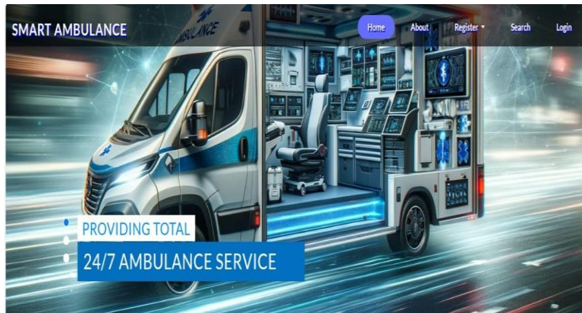
Fig 2.1 : Home Page