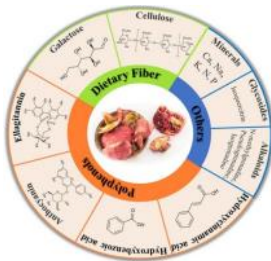
Figure1 : Bioactive compound of pomegranate peel [18]