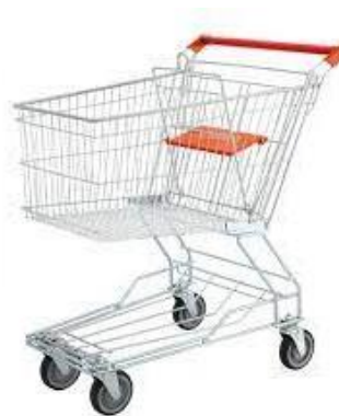
Figure 5:- Shopping Cart

A shopping trolley in certain regions, is a specially designed wheeled vehicle created to enhance the shopping experience in retail environments. It serves as a practical and indispensable tool for customers, offering assistance in transporting selected items conveniently throughout a store. The primary purpose of this carts is to facilitate the gathering of goods as customers navigate through aisles and make their product selections.