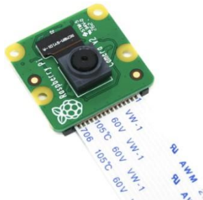
Figure 3:- Web Camera

A digital camera device designed to connect to and function with a Raspberry Pi microcomputer. These webcams are typically USB-powered and can be easily integrated into the Raspberry Pi's USB ports. They serve as an essential component for various projects and applications that involve image or video capture, such as surveillance systems, home automation, video streaming, and more.