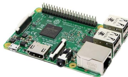
Figure 4:- Raspberry Pi

for hobbyists, makers, and professionals working on various projects. The device is made affordable, accessible, and easily programmable, making it an ideal tool for learning about computing and electronics.