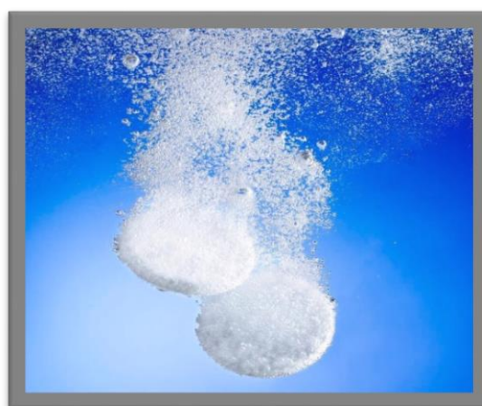
Figure 12:- Effervescent tablet

Effervescence is the evolution of gas bubbles from a liquid as a result of a chemical reaction. Effervescent tablets contain particular qualities for medical applications that enable quick medication absorption [21]. Advantages of Effervescent tablet is used to facilitate the administration of dosages, offer the best compatibility, promote superior and quick absorption, enhance a patient's intake of liquids, and get around the challenge of swallowing large medications.