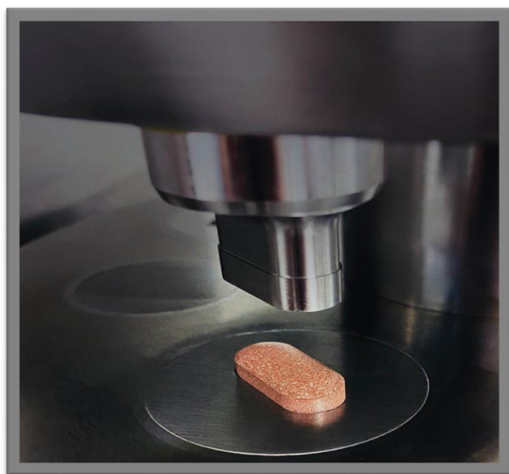
Figure 18:- Sticking

Reason: Granules that have been incorrectly dried or lubricated are the cause.