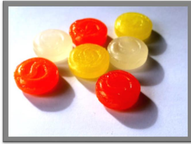
Figure 7:- Lozenges and troches