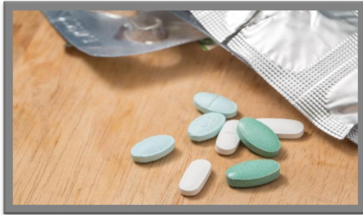
Figure 3:- Enteric-coated Tablets