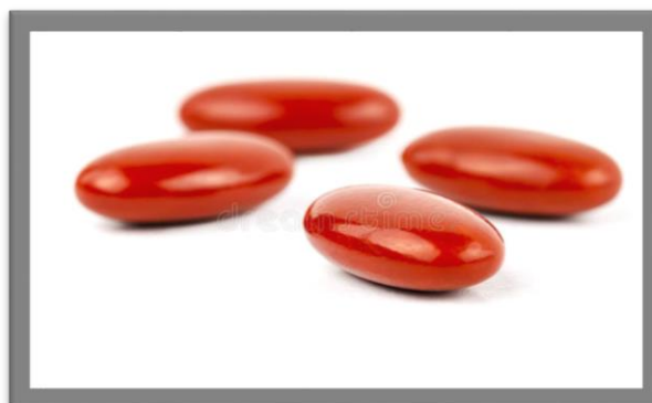
Figure 5:- Film-coated Tablet

Since the sugar coating process takes a long time, film coating technology has taken the place of this method. A thin, smooth layer is created on the tablet surface by spraying a polymer, pigment, and plasticizer solution onto a rotating tablet bed. The preferred site of medication release (stomach or intestine) or the preferred release rate largely determines the polymer to be used [13]. Advantages of Film-coated Tablet is Protection. Easy identification. Reduced GI Irritation. Improve Stability.