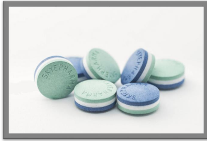
Figure 2:- Layer Tablet