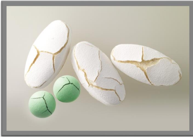
Figure 16:- Cracking