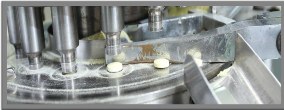
Figure 20:- Binding

Binding is typically caused by too much moisture in the granules, a lack of lubrication, and/or the use of old dies.