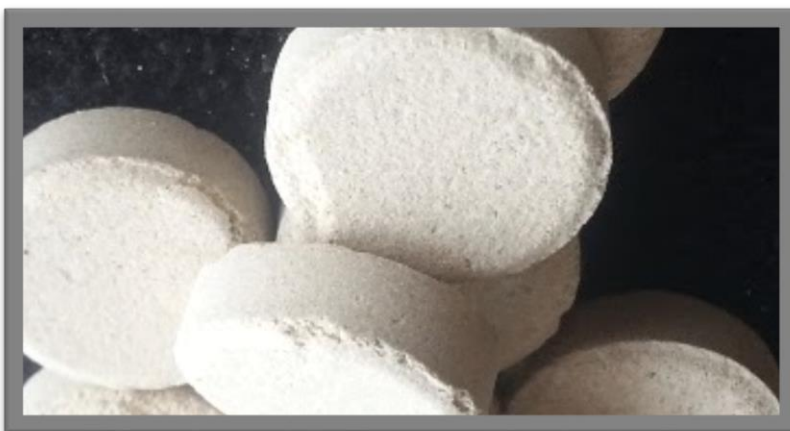
Figure 17:- Chipping

Reason: In particular, improperly set ejection takeoff and incorrect machine settings.