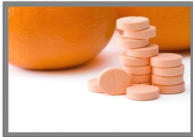
Figure 6:- Chewable Tablet

Chewable dosage forms, such as tablets, little pills, and gums, are a common tool in the drug specialist toolbox. Before administration, they must be broken and chewed in the middle of the teeth. The advantages over solid dosage forms intended for swallowing include good bioavailability, improved patient consistency due to the elimination of the need for water swallowing, the potential use of solid dosage forms as a substitute where quick onset of action is required, and improved patient acceptance, such as when these tablets are given to children or patients who are unable to swallow. Chewable pills must be chewed in a buccal depression before swallowing because these dose forms are big and difficult to swallow. The best qualities of chewable tablets that include quick to [14]. Advantages of Chewable Tablet is Patient convenience. Better absorption characteristics. Enhancing bioavailability comes about because of an expanded ingestion rate, because of its disintegration or being bitten in the mouth into the increased dissolution. Improved understanding acknowledgment through lovely taste.