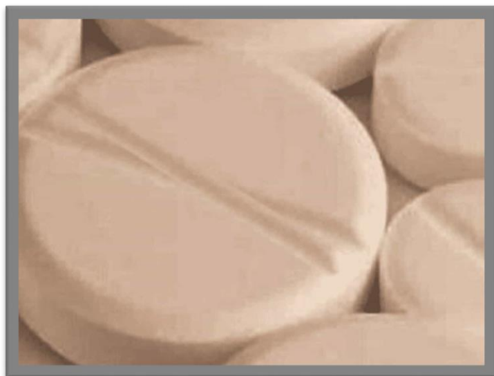
Figure 22:- Double Impression

A monogram, engraving shape, break line, score line, imprint, or logo appearing twice on a tablet's surface is known as a double impression and is a machine-related tablet problem.