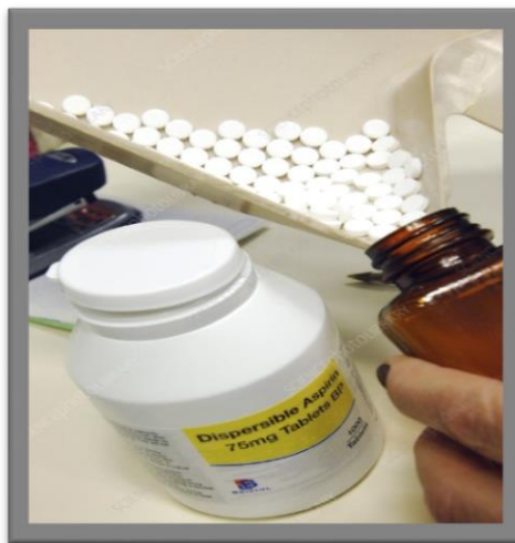
Figure 13:- Dispensing tablets