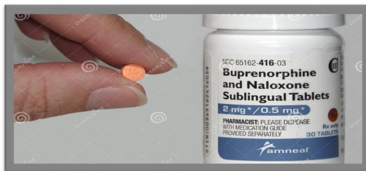
Figure 8:- Sublingual Tablet

The sublingual medications are typically tiny, flat, and lightly crushed to maintain their softness. To enable fast API absorption, the tablets must disintegrate quickly. After the tablet is placed in the mouth under the tongue, the patient must abstain from eating, drinking, smoking, and possibly talking to keep the tablet in place. It is designed to disintegrate in small amounts of saliva. The need for a quick start of pharmacological activity led to the development of sublingual systemic drug delivery [17]. Advantages of Sublingual Tablet is Ease of administration for patients, such as young children, elderly people, and people with mental illnesses, who are unable to swallow a tablet. Compared to liquid preparations, the simplicity of drug administration and precise dosing. The dose form does not require water to be swallowed, which is a practical feature for patients who are traveling and may not have easy access to water.