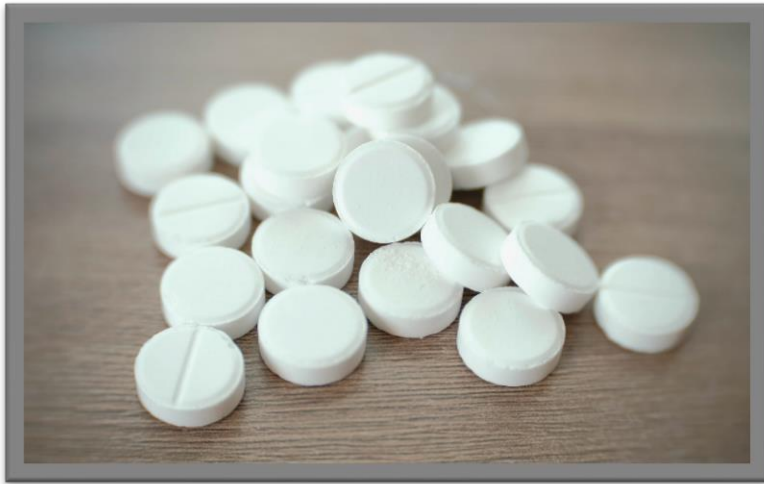
Figure 1:- Standard Compressed tablet

These tablets are simply manufactured with the use of compressive force. Depending on the properties of the coating material, they could have a coating or not. Such as direct, moist granulation, or dry granulation procedures Compression is typically used for compressed tablets [6]. Advantages of Standard Compressed tablet is Simplified, Shorter Processes. Cost Savings. Improved Stability. Reduced Wear on Press Components.