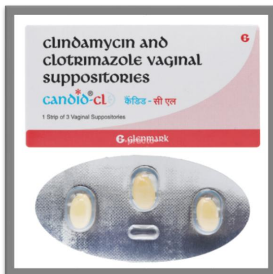
Figure 11:- Vaginal tablets