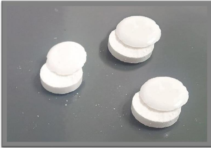
Figure 14:- Capping