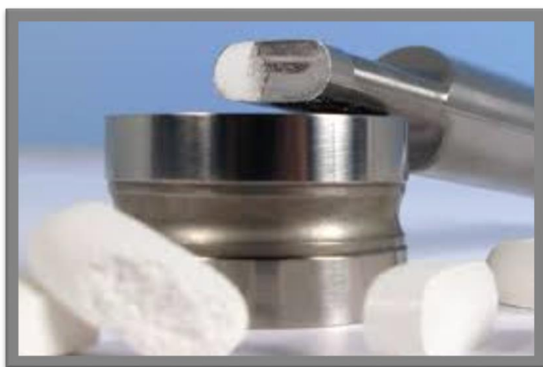
Figure 19:- Picking

Reason: Picking is particularly dangerous when granular material is inadequately cured and punch tips have engraving or embossing letters.