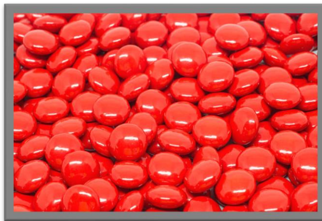
Figure 4:- Sugar coated Tablets

1 Sealing, 2 Sub coating, 3 Grossing/Smoothing, 4Coloring, 5Polishing [12]. Advantages of Enteric-coated Tablets is Improved Test. Easy to Swallow. Protection. Flexibility.