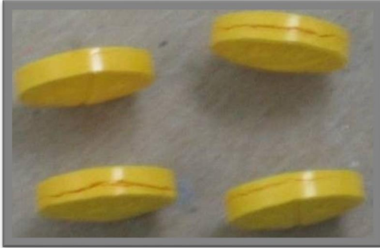
Figure 15:- Lamination

The situation is made harsher by the turret's increased speed.