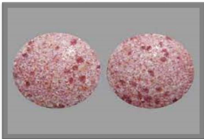
Figure 21:- Mottling