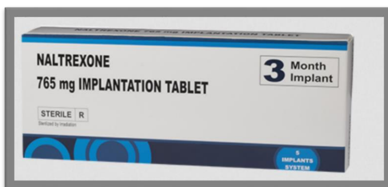
Figure 10:- Implantation tablets

The process by which the embryo affixes to the uterine endometrial surface invades the epithelium, and eventually enters the mother's bloodstream to develop into the placenta is known as implantation [19]. The advantages of Implantation tablets are Highly Effective. Low Maintenance. Discreet.