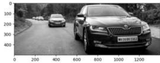
Fig. 2. GRAYSCALE IMAGE

number of further steps that function as follows: 1. Loading an RGB image: First, the image that has to be used for number plate recognition is loaded.