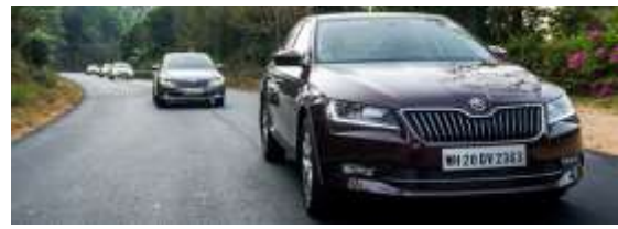
Fig. 1. Loading an image

These phases, however, are further broken down into a