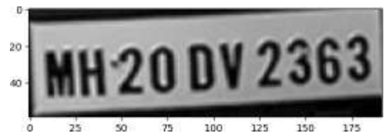
Fig. 4. Extracted Plate Region