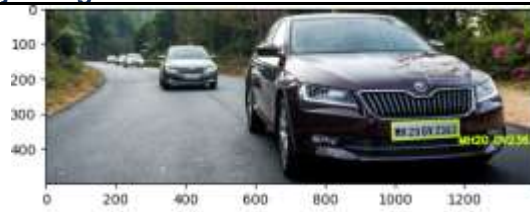
Fig. 5. Car Number Plate Successfully Detected