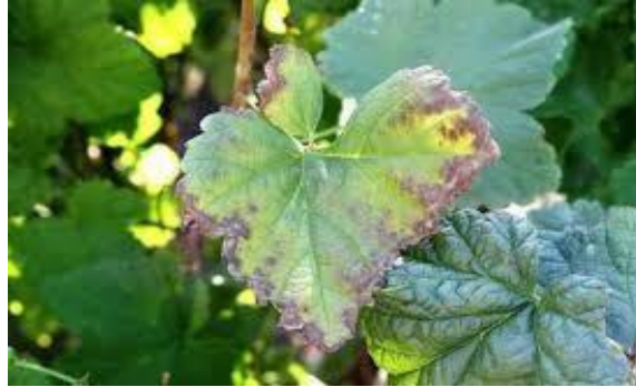
Fig. 1. unhealthy Leaf.

Hosny et al. [1] Studied apple, grapes, tomato leaf diseases including healthy, early blight, black rot and extracted its characteristic parameter such as colour texture and shape information of above plants using CNN and LBP. The accuracy of this method reached 98.8%, 96.5% and 98.3%.