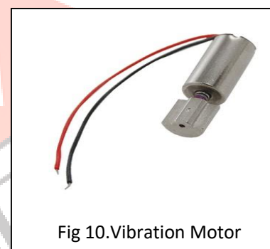
Fig 10. Vibration Motor

The most obvious application is using vibration motors for haptic feedback and vibration alerting functions.