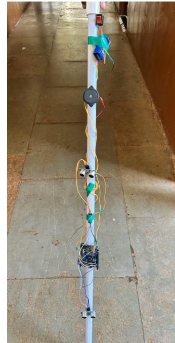
Fig 11 Working Module of smart sight cane