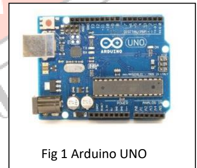
Fig 1 Arduino UNO

One of Arduino's standard boards is the UNO. The Arduino UNO is a controller built around the ATmega328P Micro. It is easier to use than other boards, such as the Arduino Mega board, etc. The Arduino board contains the following parts: an ATmega328P microcontroller, an ICSP pin, an LED power indicator, digital I/O pins, analog pins, an AREF pin, a voltage regulator, a Tx and Rx LED, USB, and a reset button.