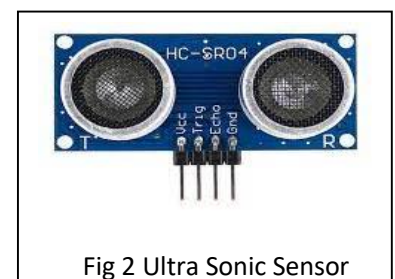
Fig 2 Ultra Sonic Sensor

An ultrasonic sensor, which is frequently used in robotics and automation, measures the distance of an object by generating pulses and measuring the return of the sound wave.