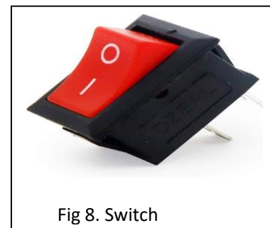
Fig 8. Switch

To operate an electric device, an electric circuit must be completed or broken using a switch. A switch completes the circuit and permits current to pass through when it is in the ON position.