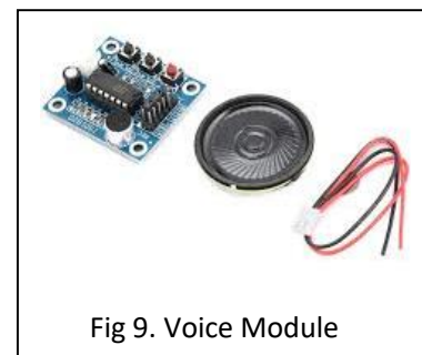
Fig 9. Voice Module

The Voice Module provides the driver with audible orders so they may hear the textbook information that comes from the Voice operation.