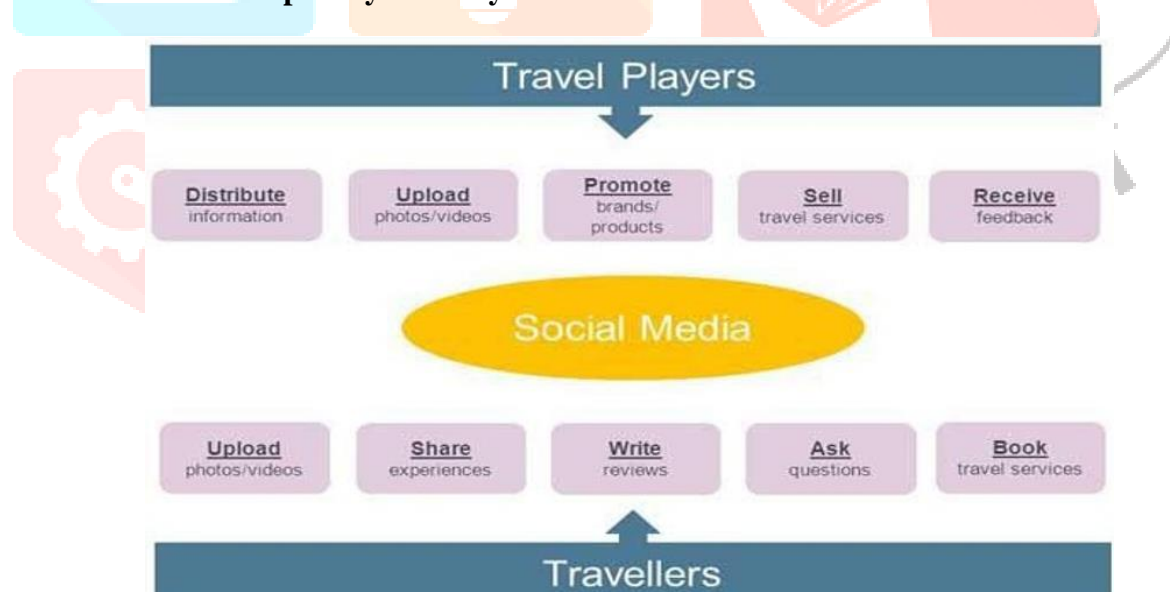
Figure 2 How Social Media Works for Travel Players