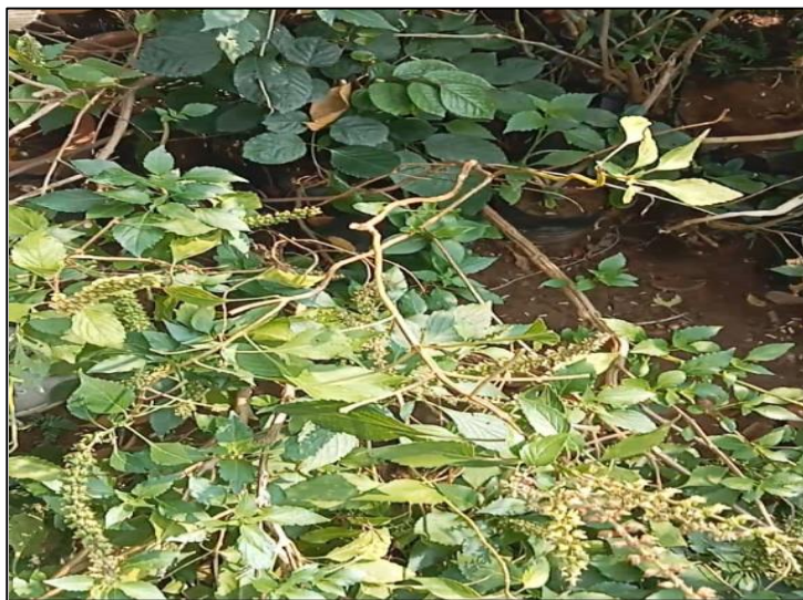
Figure 1. Ocimum gratissimum

There are 200 species of herbs and shrubs in the Lamiaceae family's genus Ocimum (Simon et al. , 1999). Because its leaf gives many items a unique flavour, this species has a long history of use as culinary herbs. It is also a source of essential oils and aroma compounds with nematicidal and insecticidal qualities that are physiologically active (Deshpande and Tipnis, 1997; Chaterje et al. , 1982). However, because of their redox characteristics, which allow them to function as reducing agents, hydrogen donors, and singlet oxygen quenchers, phenolic compounds are positively connected with the antioxidative potential of herbs and spices (Caragay, 1992). The primary phenolic compounds present in plants are secondary metabolites with strong antioxidant activity that are widely distributed throughout the Lamiaceae family of plants (Gang et al. , 2001; Hakkim et al. , 2008)