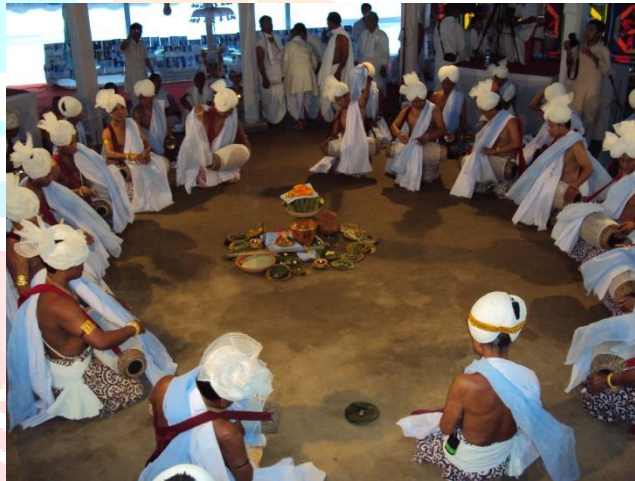
Fig. No.1. Nityai Dhrumel

Drupad Hari Sankirtana was known by the name of Dhrumel Hari Sankirtana to the Manipuris from the very beginning. However, Maharaj Bhagyachandra made it so popular that Manipuris knew it as an unique Maha Dhrumel for a long time. Then with the passage of time, following the footsteps of their predecessors, Maharaj Gambhir Singh offered Goura Dhrumel , Maharaj Narasingh offered Nityai Dhrumel (as shown in Fig. No.1) and Maharaj Chandrakriti offered Devi Dhrumel . Then the previous Dhrumel Hari Sankirtana ultimately came to be known as Nata Sankirtana keeping in mind the idea of prayer through Sankirtana. And this was how Drupad Sankirtana was divided into two types in Manipur, viz. Ariba Pala (Bangdesh Pala) and Nata Sankirtana (Nata Pala).