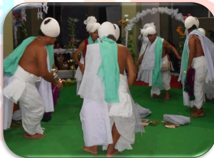
Fig.No.3 Nata Sankirtana in Raasa Leela

There are many stories in Bharata's Natya Sashtra that reminds us Purvaranga being performed by the Nirgit , Bahirgit and Geet Vidhi . The three types of songs included in Nata Sankirtana can please all the Devas and Devis . The Gurus knew this and confidently believed in the potentiality of these songs to please the Devas and Devis . The various ritualistic procedures included in Nata Sankirtana clearly prove that it was performed according to the prescribed laws of Sashtra . The rules are followed till today without any disruption or changes according to Sashtra , Raga Hauba , the first part of Nata Sankirtana is known as Utthapani Dhruva . So, Utthapani Dhruva is the starting point of the Sankirtana associated with Upohana . Here, Nirgit and Bahirgit are offered in the form of a puja to the Devas in the Tala Prabandha known as Vardhamanak .