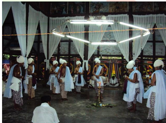
Fig.No.2 Nata Sankirtana

This particular taal is used for praising and worshipping gods because it has the look of pranav ( as shown in fig. No.2) Rajarshi Bhagyachandra introduced this style of kirtana singing known as Nata Sankirtana which found its supreme expression during the reign of king Chandrakirti of Manipur(1850-1886) when the sixty-four rasa were presented for the first time in sixty four sessions spreading over thirty two days. The Manipuri musician singing kirtana as called Nata - a classical term Sanskrit, meaning the person who knows the four abhinayas and different types of Natya , gets himself merged in the rasa which he is trying to portray and who appears physically on the stage: a dancer with songs on the lips.