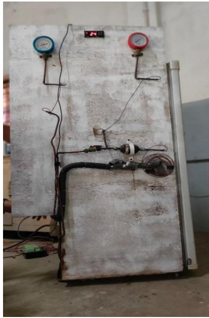
Figure 2. Represents the refrigeration test rig

The values obtained from the experimentation were used to evaluate the performance characteristics of the domestic refrigerator. Parameters such as refrigeration capacity ( Q_w ), work done by the compressor ( W ), COP are considered.